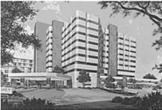
Figure 2 Exterior application of APC sheets

Aluminum composite panel is the most versatile building material for exterior and interior uses. Examples of exterior (curtain walling and wall paneling) usages include high rise commercial, industrial, residential buildings, shopping malls, etc. Specific functions are for store canopies, shop fronts, dealer sign boards, display units, innovative furniture, partition, etc. Many developers now suffer from stained concrete, cracked masonry, falling render and other time related problems.