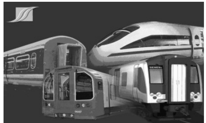
Figure 4 Application of APC sheets in transportations items

To secure and expand the market share, different commercial establishments like modern shopping centres, famous corporations, banks, supermarkets, petrol pumps, car showrooms require good infrastructure,