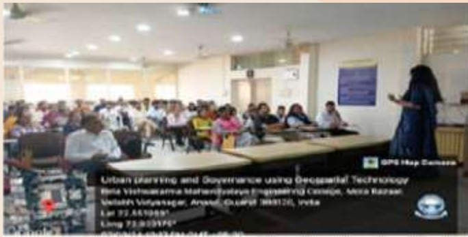
Speaker and the participants during the seminar

They organized a Seminar on "Urban Planning and Governance Using Geospatial" on 7 March 2024.