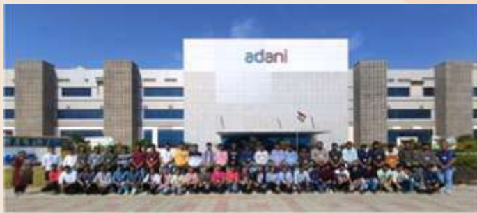
Participants during the visit

They organized an Industrial Visit at Adani Industries Mundra, Gujarat during 2-3 April 2024 and to Institute of Plasma Research, Gandhinagar during 8-9 April 2024.