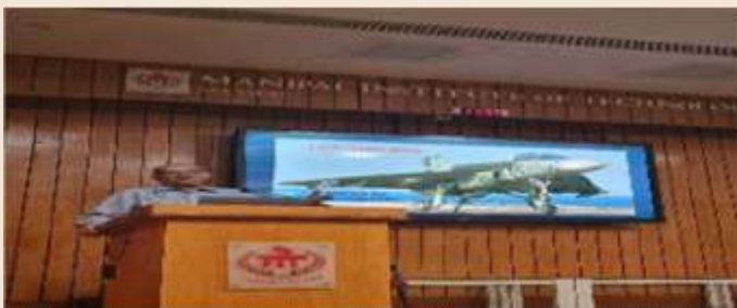
Speaker during the event

The IEI Students' Chapter Aerospace Engineering Department conducted a Guest Talk on "History of the LCA(Light Combat Aircraft)-Tejas on 26 March 2024.