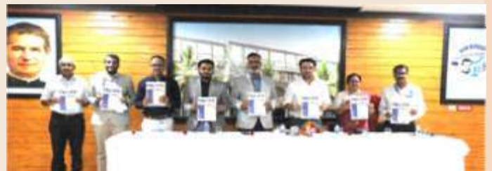
View of the dias

The IEI Students' Chapter, Mechanical Engineering Department of Don Bosco College of Engineering was inaugurated and celebrated World Engineering Day also on 15th March 2024.