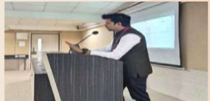
Speaker during the event

The IEI Students' Chapters of Thakur College of Engineering and Technology organized a Workshop on 'Research Paper Writing' held on 13 February 2024.