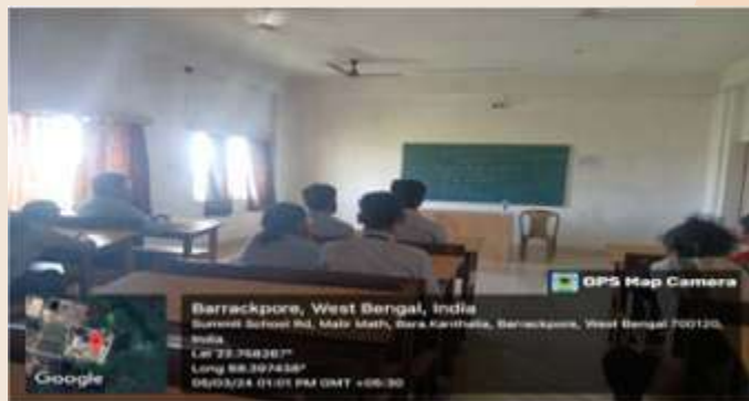
Participants during the event

The IEI Students' Chapter of Regent Education and Research Foundation organized a Technical film show on 15 March 2024.