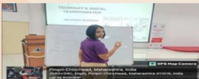
Speaker during the event

The IEI Students' Chapter, Department of Mechanical Engineering of Army Institute of Technology organized Two Days Seminar on "Innovation, Entrepreneurship and Career Building" during 29 February to 1 March 2024.