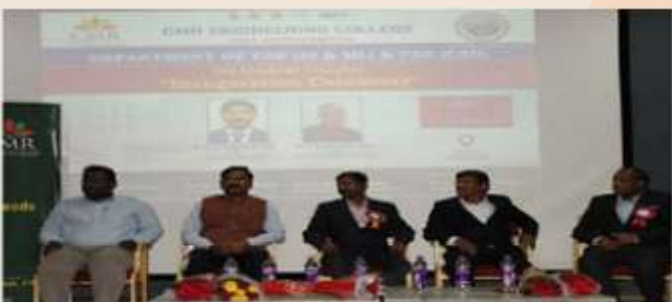
View of the dias