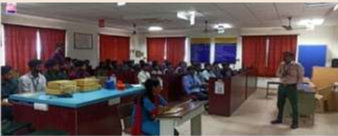
Speaker and participant during the event

They organized an Invited Talk on "Sensors and Instrumentation" on 17 April 2024.