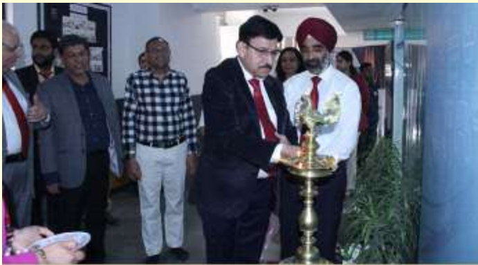
View of lighting of the lamp

Third Regional Conclave of Students' Chapter of The Institution of Engineers (India) for Northern Region was organized on the theme 'Innovations Shaping the Future: Exploring Emerging Trends in Engineering: Exploring Emerging Trends in Engineering' on 16 March 2024 hosted by the Student Chapter of The NorthCap University, Haryana in association with Haryana State Centre and