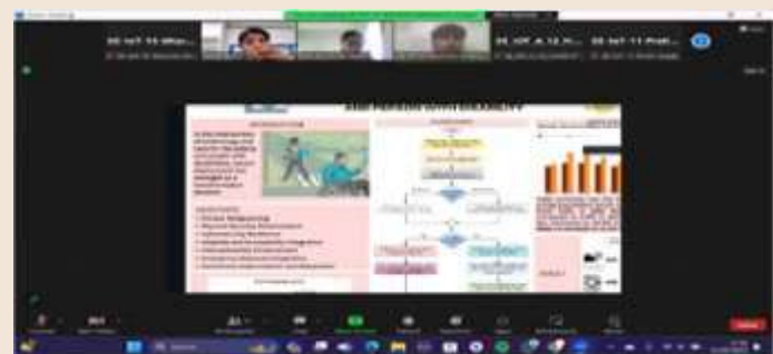
Screenshot of the event

The IEI Students' Chapter also organized a 'Technical Idea Presentation' conducted Online on 20th February 2024.