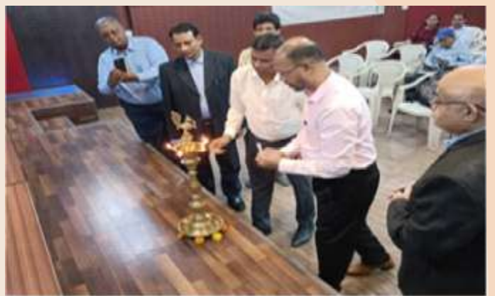
Lighting of the lamp during the event

The IEI Students' Chapter of Indian Society of Structural Engineers organized seminar on "Softwares for Structural Engineers" on 19 January 2024.