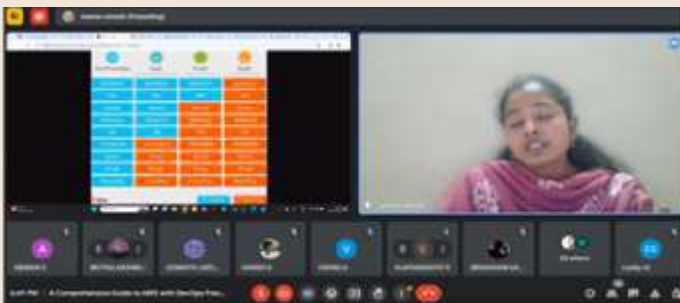
Screenshot of the lectures

They also organized a Guest Lecture on "A Complete Guide to AWS with DevOps Practices" on 4 April 2024 and on "Automation Testing and Tools" on 19 April 2024.