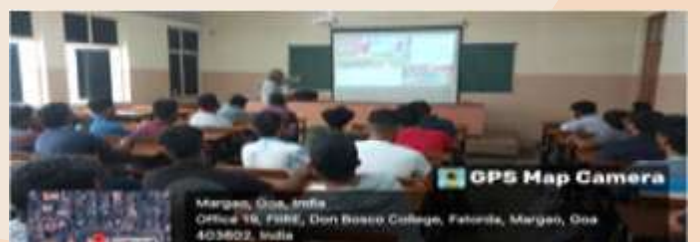
Speaker and the participants during the event

The IEI Students' Chapter, Mechanical Engineering Department of Don Bosco College of Engineering conducted a Seminar on "Basic First Aid" on 18 April 2024.