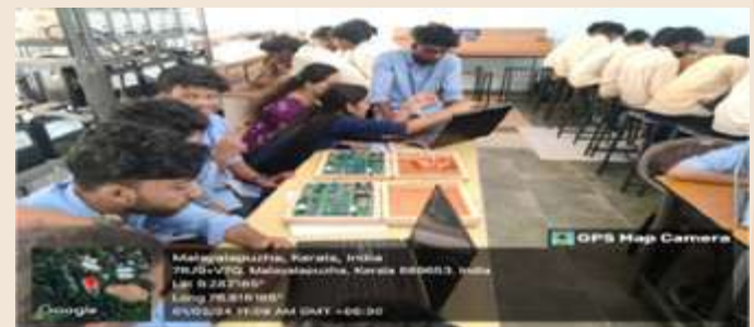
Participants during the event