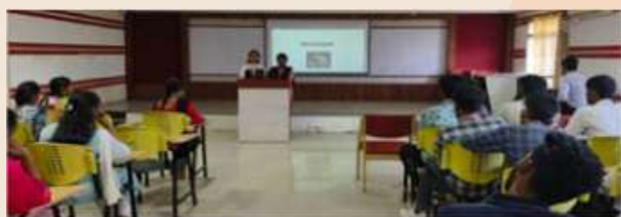
Participants during the event

The IEI Students' Chapter, Department of Electronics and Communication Engineering of Narayana Engineering College celebrated "World Earth Day" on 22 April 2024.