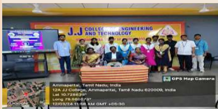
View of the dias

The IEI Students' Chapter of Department of Computer Science and Engineering of J J College of Engineering and Technology inaugurated on 12 March 2024.