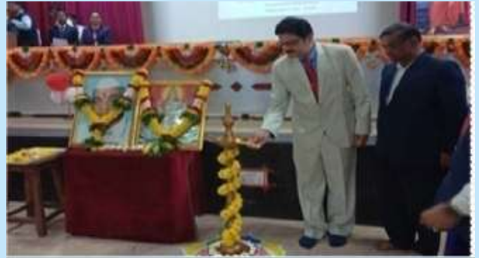
Lighting of the lamp ceremony

The IEI Students' Chapter of Amrutvahini Polytechnic was inaugurated on 13 March 2024 followed by a Technical Event 'Amrutfest'.