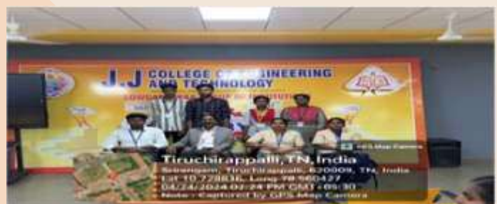
View of the participants during the inauguration

The IEI Students' Chapter, Department of Information Technology of J J College of Engineering and Technology was inaugurated on 24 April 2024 alongwith Technical Quiz Competition.