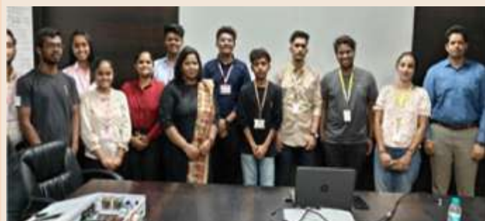
Participants during the event

They conducted a One Day Technical Tour at the BuildINT Corporate Office on 5 April 2024.