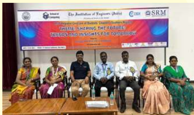
Speaker with the organizers