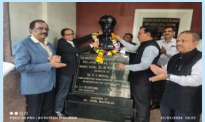
Garlanding during the inaugural session

The IEI Students' Chapter of Bharati Vidyapeeth Institute of Technology organized Seminar on "Identification and Control of Static Electricity Hazard in Chemical Industry" on 21 January 2024.