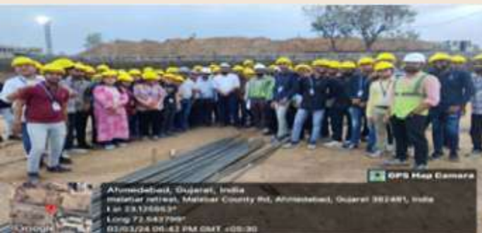
Participants during the visit

The Students' Chapter organized a "Technical Visit to L & T – CSTI and Multi-Storey Building" on 2 March 2024.