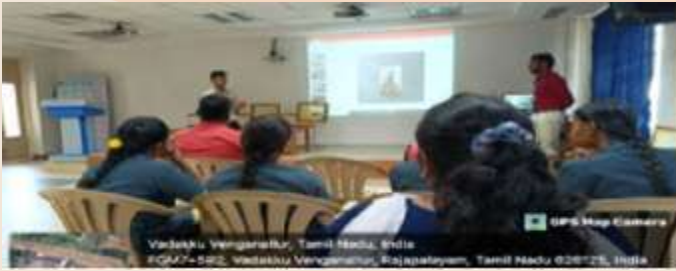
Participants during the event

The IEI Students' Chapter, Department of Mechanical Engineering of Ramco Institute of Technology organized a Webinar on "Automation in Machine Learning" on 13 April 2024.