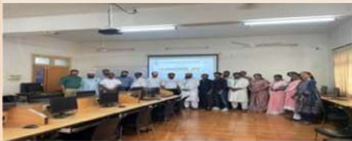
Participants during the event

The IEI Students' Chapter, Department of Civil Engineering of P A College of Engineering organized a captivating technical talk on "Drone-Based Mapping" on 12 March 2024. They also organized "Kaushal – 24 – A Project Competition and Expo" on 3 May 2024.