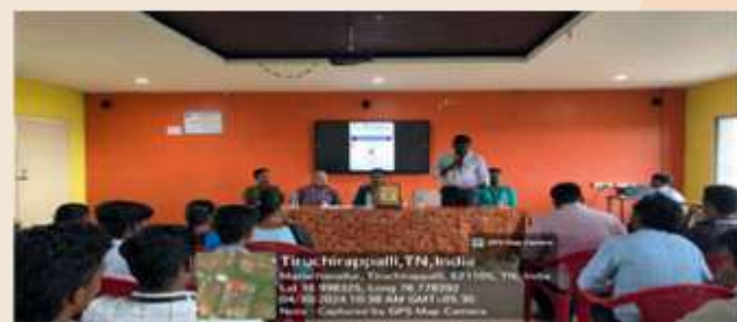
View of the dias