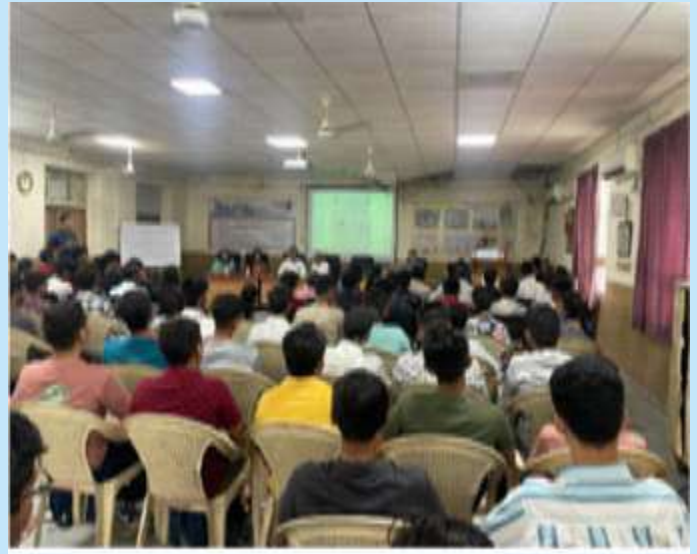
Participants during the event

They arranged an Expert Talk on "Solar Design: Opportunities and Challenges" on 4 April 2024.