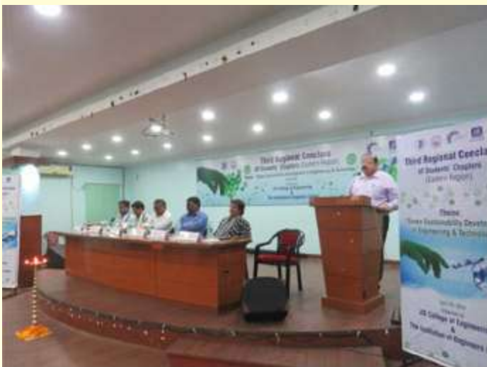
View of the dias