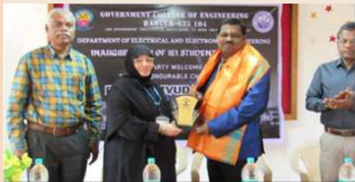
View of the dias during the inaugural session

The IEI Students' Chapter, Department of Electrical and Electronics Engineering of Government College of Engineering, Bargur was inaugurated and organized Workshop on Industrial Automation using PLC on 13 March 2024.