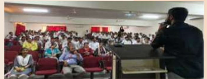
Speaker during the event

The IEI Students' Chapter, Information Technology Department of Chameli Devi Group of Institutions organized Expert Talk on "Defensive Side of Cyber Security" on 16 April 2024.