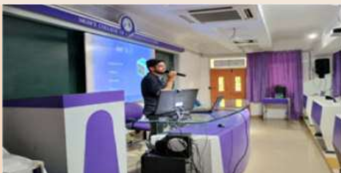
Speaker during the workshop

The IEI Students' Chapter, Computer Science & Engineering Department of M G M's College of Engineering organized a One Day Workshop on "Git and GitHub" on 3 April 2024.