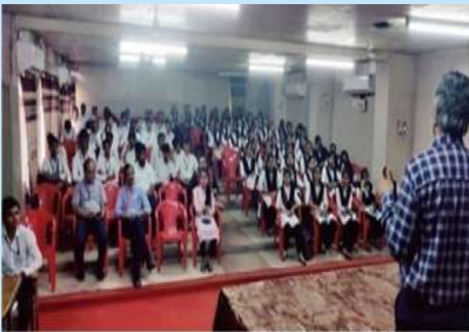
Participants during the event

The IEI Students' Chapter, Department of Civil Engineering of Government Polytechnic organized Lecture on "Opportunities for Civil Engineers" on 13 March 2024.