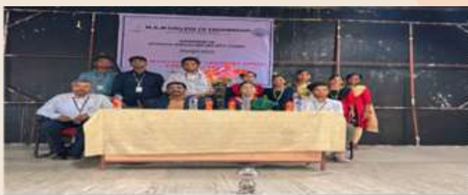
View of the dias

The IEI Students' Chapter, Department of Artificial Intelligence and Data Science inaugurated on 30 April 2024.