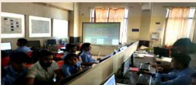
Participants during the workshop

The IEI Students' Chapter, Department of Mechanical Engineering of Loknete Gopinathji Munde Institute of Engineering & Research organized "Two Days Workshop on FEA using ANSYS Workbench" during 6 – 7 March 2024.