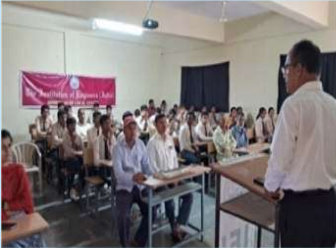
Speaker and the participants

The IEI Students' Chapter of Dr. N J Paulbudhe College of Polytechnic organized Technical Lecture on "Indian Automobile-Car Segment" on 3 April 2024.