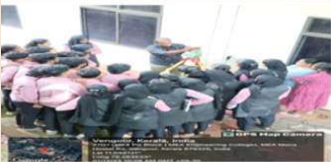
Participants during the event

The IEI Students' Chapter, Department of Civil Engineering organized a Workshop on "Total Station" on 1 December 2023.