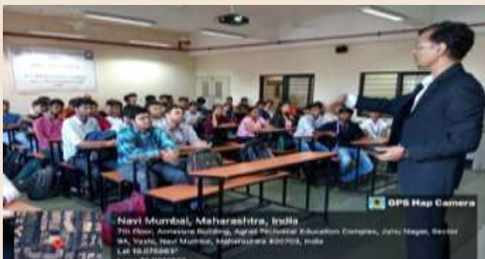
Speaker and the participants during the seminar

The IEI Students' Chapter, Department of Electrical Engineering of Fr. C Rodrigues Institute of Technology organized a Seminar on "Electric Vehicle" on 9 February 2024.