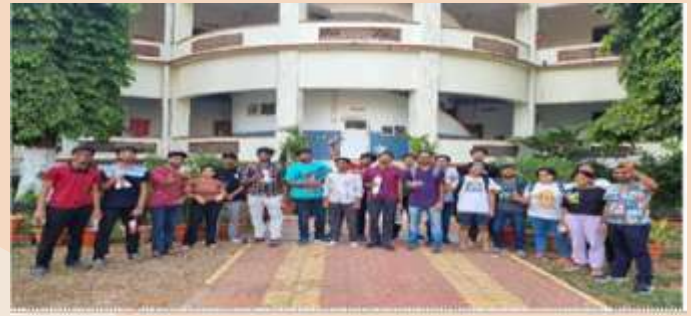
Glipses of the event

On "Bottle Rocket Competition" on 28 March 2024.