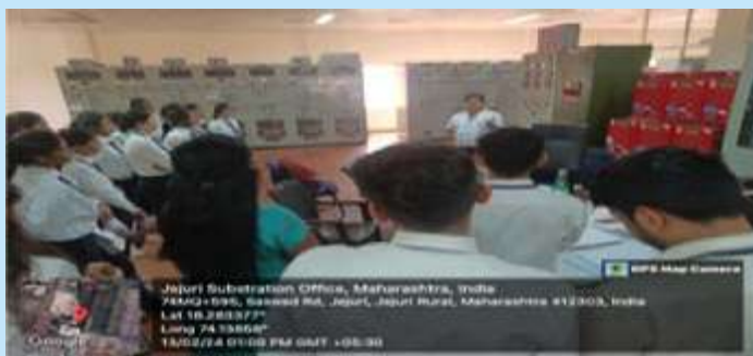
Participants during the visit