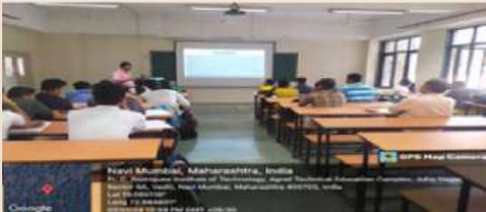
Participants during the event

The IEI Students' Chapter, Department of Mechanical Engineering of Fr. C Rodrigues Institute of Technology conducted Short Term Training Program on Tools and Methods of Research and Publications during 2-6 January 2024.