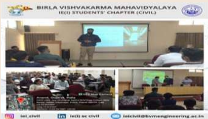
Speaker and the participants during the seminar

They also arranged a Seminar on "Green Building Innovation: Sustainable Material and Technology" on 8 April 2024.