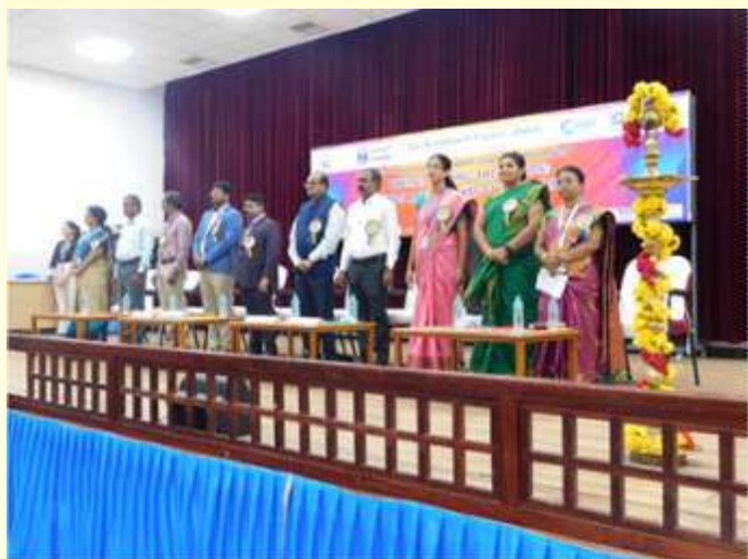
View of the dias during the inauguration of the Regional Conclave

Technologies That Will Transform Industries". In this auspicious occasion, a Panel Discussion was held on the theme, "Disruptive Technologies Across all Domains" where Mr