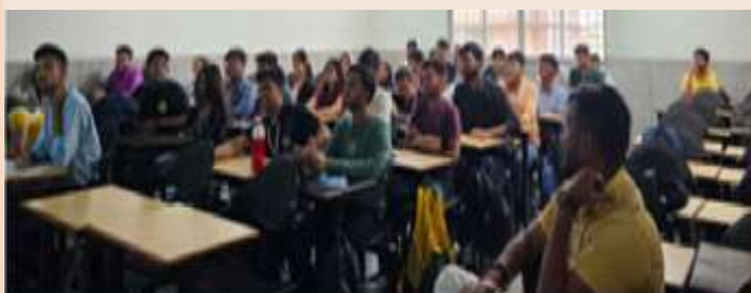
Participants during the event

The IEI Students' Chapter also organized a Seminar on "Business Model Canvas" on 3 April 2024.