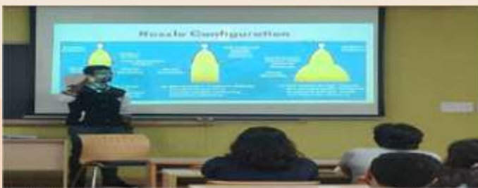
Speaker during the event

The IEI Students' Chapter Aerospace Engineering Department conducted a Rocketry Workshop on "Basics of Rocket Theory and Science behind Rocketry" on 27 March 2024.