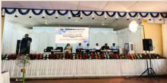
View of the dias during the inaugural session

The IEI Students' Chapter of Department of Computer Engineering of TKM Institute of Technology inaugurated on 6 March 2024.