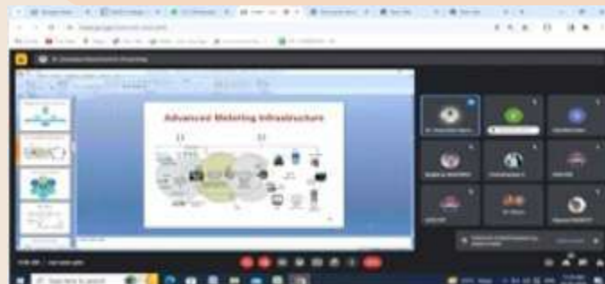
Screenshot of the event

The IEI Students' Chapter, Department of Electrical & Electronics Engineering of M A M College of Engineering and Technology organized a Webinar on "Recent Trends in Smart Grid Technologies" on 20 March 2024.