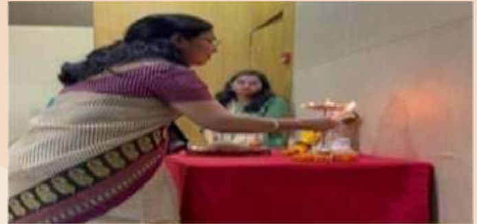
Lighting of the lamp during the inaugural ceremony

The IEI Students' Chapter, Department of Civil Engineering of Sarsawati College of Engineering inaugurated on 25 January 2024.