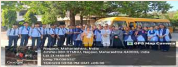
participants during the event

They conducted an Industrial Visit to RTMNU Automation and Robotics Department on 13 March 2024.