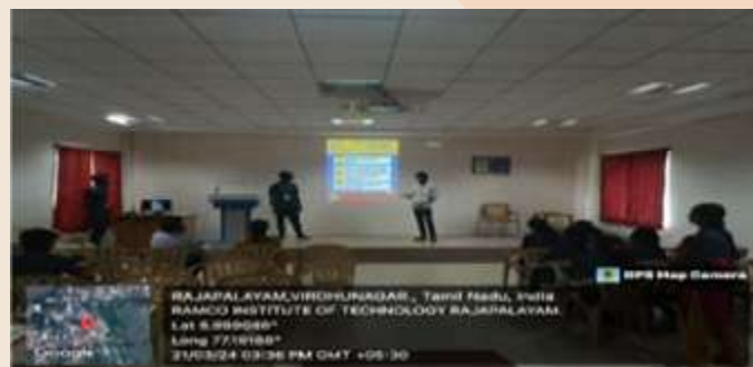
Participants during the event

They conducted a "Poster Designing" competition on 21 March 2024 and an "Aptitude Quiz "competition on 8 March 2024.