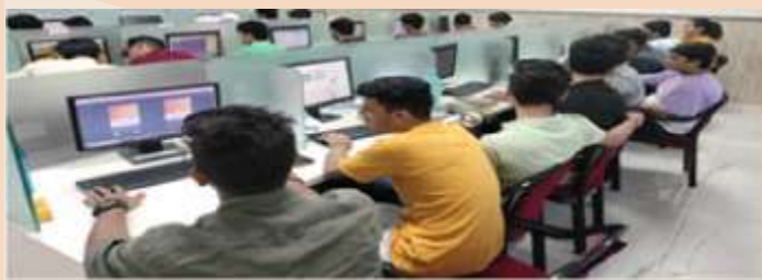
Participants during the event

The IEI Students' Chapter also organized a Seminar on "Business Model Canvas" on 3 April 2024.