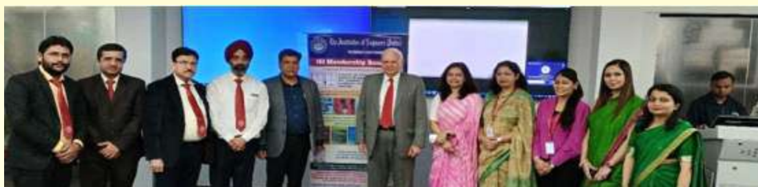
Dignitaries attending the event