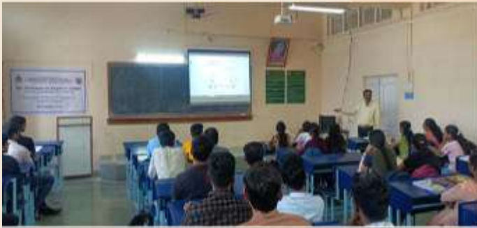
Trainer and the participants during the workshop

They conducted a One Day Workshop on "Electrical Distribution System" on 1 March 2024.