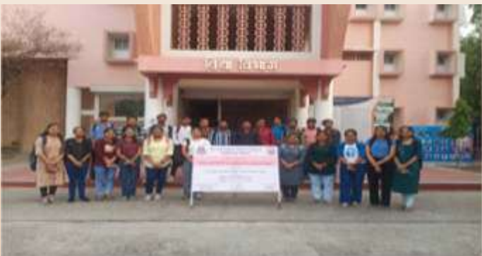
Participants during the programme

The IEI Students' Chapter, Department of Electrical Engineering of Sant Gajanan Maharaj College of Engineering organized a Four Day Student Development Program on "NI LabView Graphical System Design" during 27 – 30 March 2024.