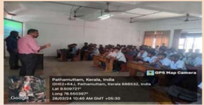
Speakers during the technical talk

They also organized a Technical Talk on "Synergising Mechanical Engineering with Logistic Expertise" on 28 February 2024.