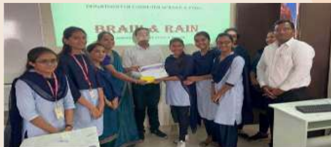
Participants during the prize distribution ceremony

The IEI Students' Chapter, Department of Computer Science and Engineering of P R Pote Patil College of Engineering & Management organized Mini Project Competition on "Brain & Rain" on 21 March 2024.