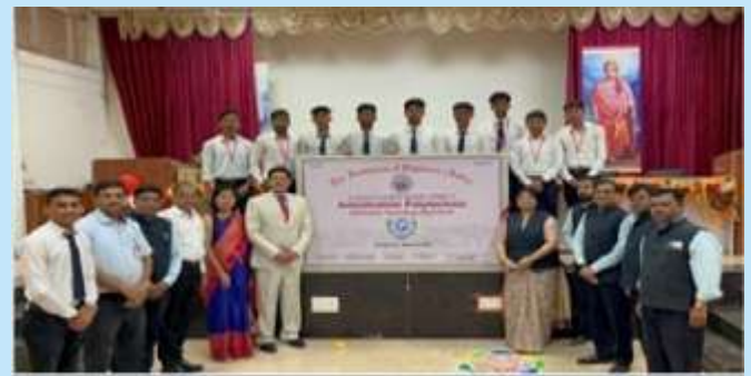
Participants during the visit