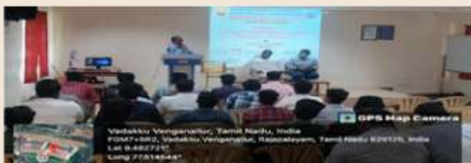
Participants during the event

The IEI Students' Chapter, Department of Electrical and Electronics Engineering conducted a Workshop on "Mastering Technical Writing: From Basics to Ethical AI and Illustrations" on 19 February 2024.