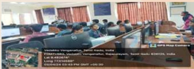
Participants during the event

They organized a workshop on 'Web Weave – Portfolio Front End Designing-HTML,CSS,JS' on 3 April 2024.