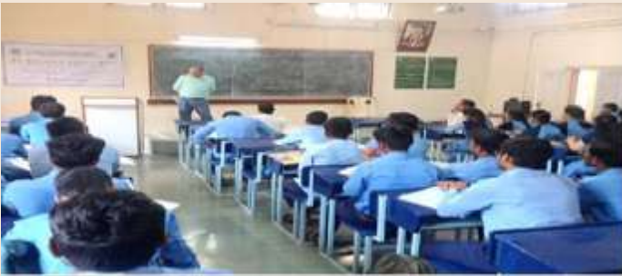
Speaker and participants during the event

They organized an Expert Lecture on "Power Distribution System" and "Transformer Protection" during 20 – 21 March 2024.