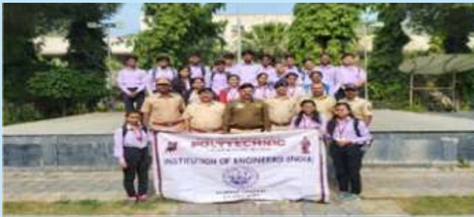
Participants during the visit

They also organized an Industrial Visit to 400 KV MSETCL Jejuri, Pune on 13 February 2024.