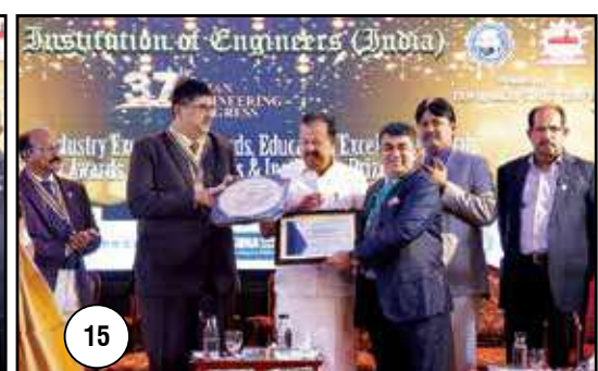
1. Hyundai Motor India Limited, Chennai; 2. Hindustan Aeronautics Limited, Bangalore; 3. NMDC Limited, Hyderabad; 4. Lenovo India Pvt Ltd, Puducherry; 5. Action Construction Equipment Limited, Palwal; 6. ONGC Tripura Power Company Limited, Gomati, Tripura; 7. Bharat Fritz Werner Limited, Bangalore; 8. Carborundum Universal Limited, Ernakulam; 9. Shakti Hormann Private Limited, Dundigal; 10. CDET Explosive Industries Pvt. Ltd., Nagpur; 11. Avantel Limited, Hyderabad; 12. Afcons Infrastructure Limited, Mumbai; 13. TATA Projects Limited, Secunderabad; 14. Engineers India Limited, New Delhi; 15. Intercontinental Consultants and Technocrats Pvt Ltd, New Delhi