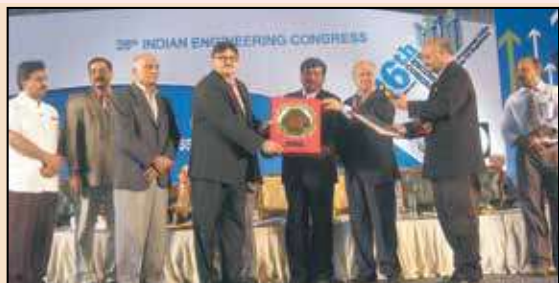
Steel Authority of India Ltd