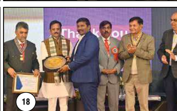
1. Hindustan Aeronautics Limited; 2. Bharat Electronics Limited; 3. Coal India Limited; 4. Salem Steel Plant; 5. BrahMos Aerospace; 6. SJVN Limited; 7. Shriram Rayons; 8. Avantel Limited; 9. TATA Consulting Engineers; 10. Engineers India Limited; 11. MECON Limited; 12. Holtec Consulting Private Limited; 13. Consulting Engineers Group; 14. Development Enviroenergy Services Limited; 15. Epicons Consultants Private Limited; 16. Afcons Infrastructure Limited; 17. Rail Vikash Nigam Limited; 18. KPC Projects Limited