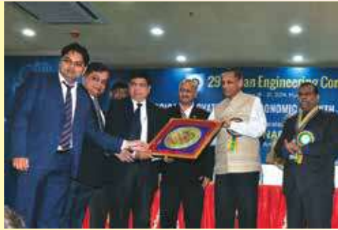
Tata Steel Limited Jamshedpur