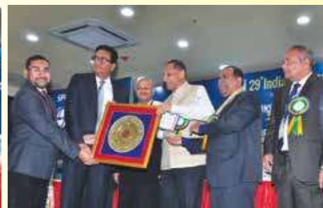
Pennar Engineered Building Systems Limited Hyderabad