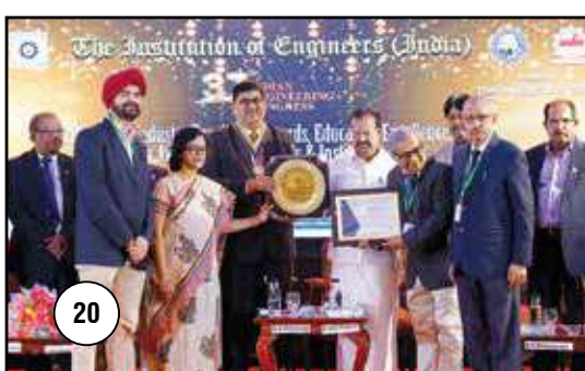
16. Maharashtra State Electricity Transmission Co. Ltd., Mumbai; 17. Consulting Engineers Group Limited, Jaipur; 18. Development Environenergy Services Ltd, Delhi; 19. Structwel Designers & Consultants Pvt Ltd, Mumbai; 20. B&S Engineering Consultants Pvt Ltd, Delhi