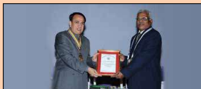
Power Grid Corporation of India Ltd