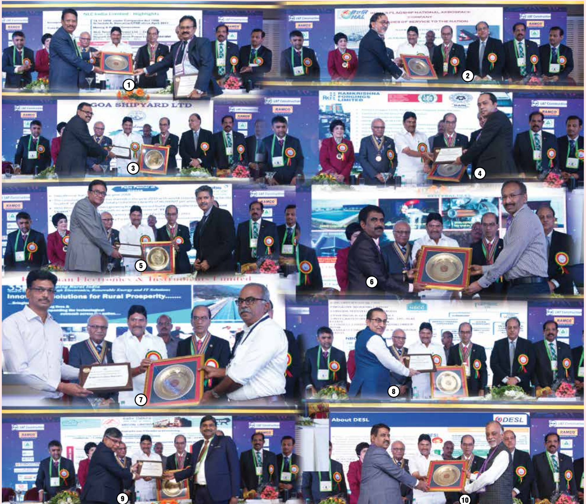
1. NLC India Limited; 2. Hindustan Aeronautics Ltd. 3. Goa Shipyard Ltd.; 4. Ramkrishna Forgings Limited; 5. Pennar Engineered Building Systems Ltd.; 6. Lanco Tanjore Power Co. Ltd.; 7. Rajasthan Electronics & Instruments Ltd.; 8. NBCC (India) Limited; 9. MECON Limited; 10. Development Envrionergy Services Ltd.