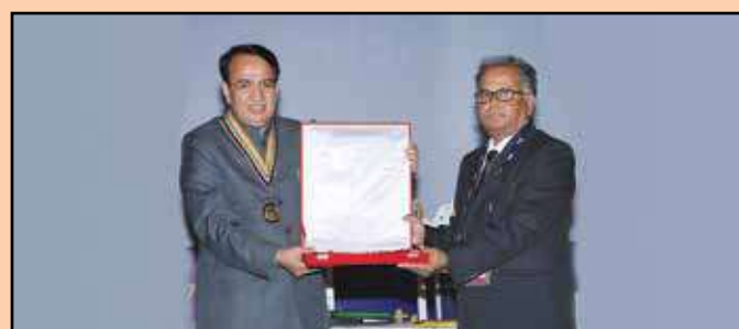
Bharat Heavy Electricals Ltd