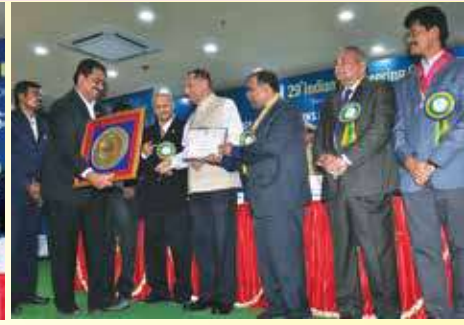
J K Tyre & Industries Ltd Chennai