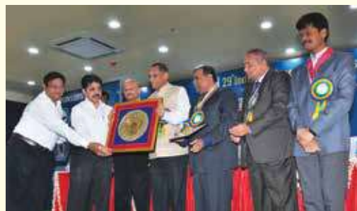
Lanco Tanjore Power Co. Ltd Tanjore