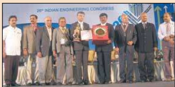
Tata Consultancy Services Ltd