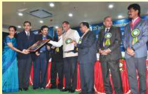
Centum Electronics Limited Bangalore