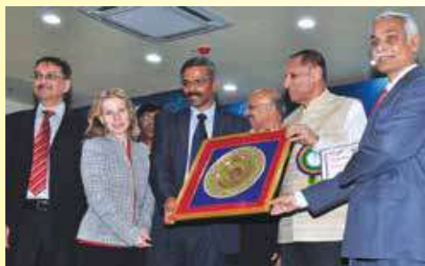
Siemens Technology and Services Pvt. Ltd. Bangalore