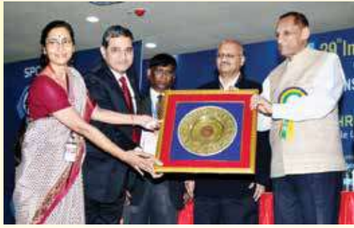
Hindustan Aeronautics Ltd Bangalore