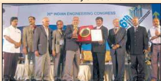
Bharat Electronics Ltd