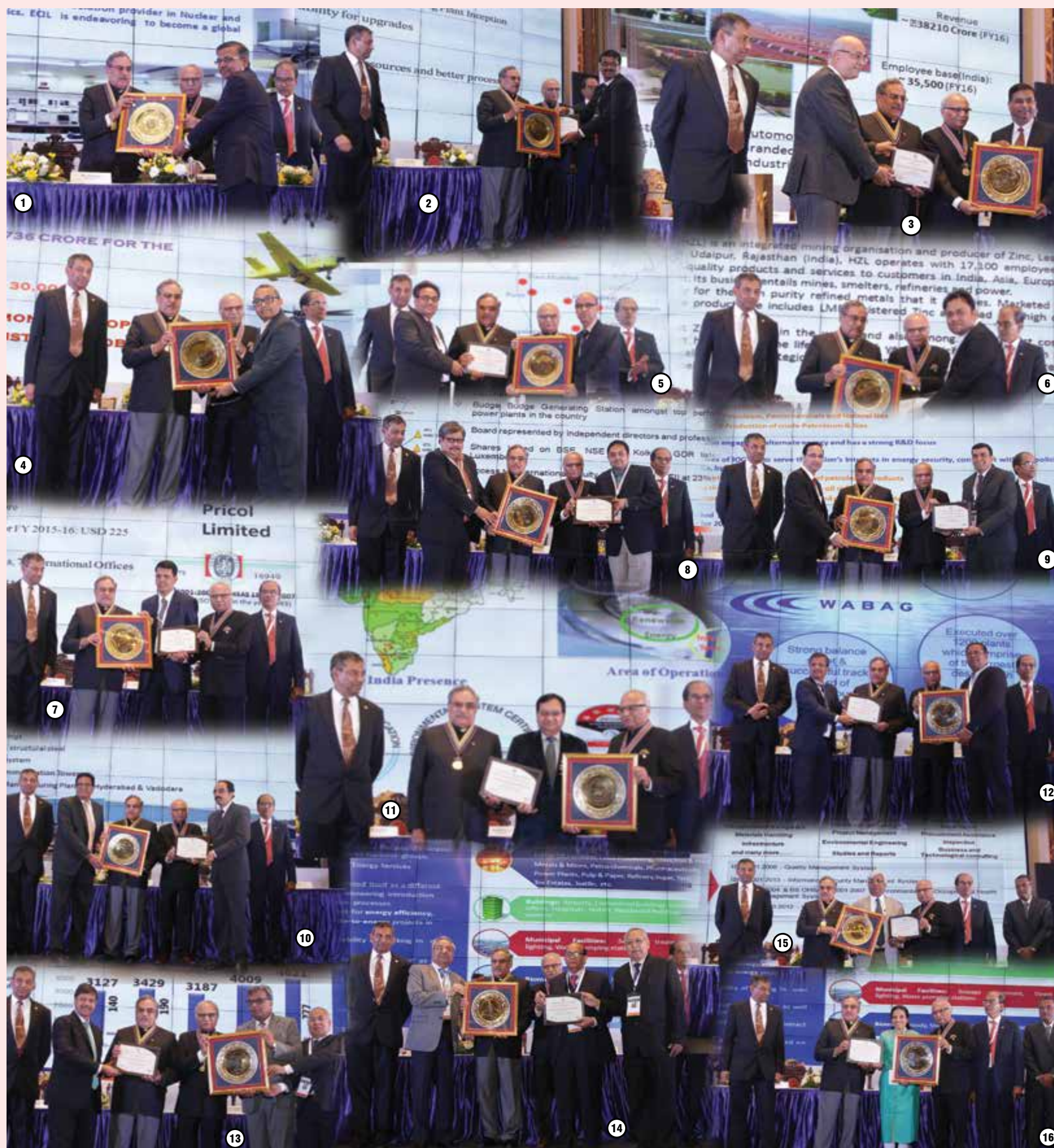
1. Electronics Corporation of India Limited; 2. J K Tyre & Industries Limited - Chennai Tyre Plant; 3. TATA Steel Ltd (India Operations); 4. Hindustan Aeronautics Limited; 5. Bharat Electronics Limited; 6. Hindustan Zinc Limited; 7. Pricol Limited; 8. CESC Limited; 9. Indian Oil Corporation Limited; 10. Pennar Engineered Building Systems Limited; 11. Rajasthar Electronics and Instruments Ltd.; 12. VA Tech Wabag Limited; 13. NBCC (India) Limited; 14. Techno Electric & Engineering Co. Ltd.; 15. M N Dastur & Company (P) Ltd.; 16. Development Environery Services Limited