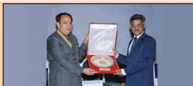
Hindustan Aeronautics Ltd