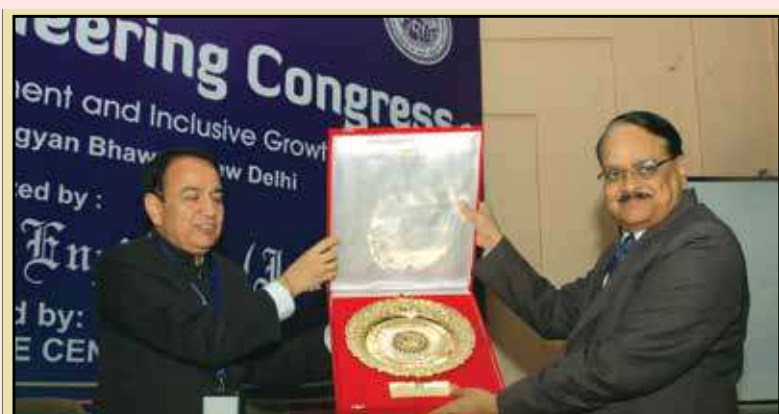
Steel Authority of India Limited

The 'IEI Industry Excellence Award' 2012 was presented during the Twenty-seventh Indian Engineering Congress held at New Delhi on December 14, 2012.