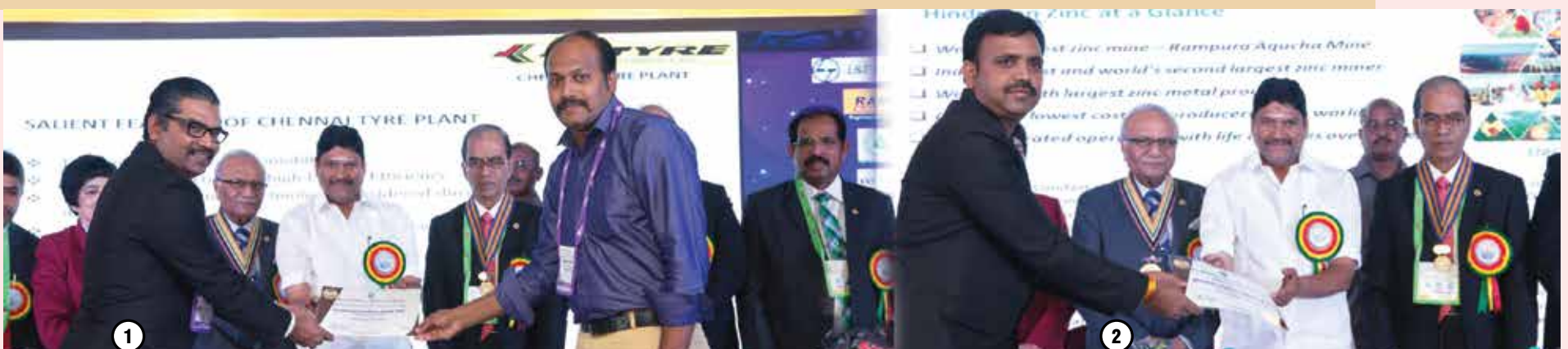
1. J K Tyre & Industries Ltd. Chennai Tyre Plant; 2. Hindustan Zinc Ltd.