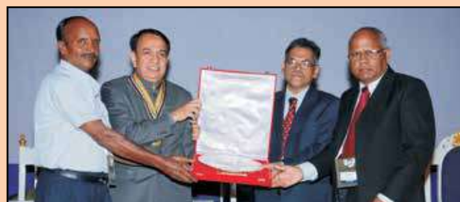
Thirumalai Chemical Ltd