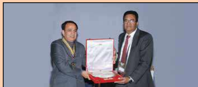
Pennar Engineered Building Systems Ltd