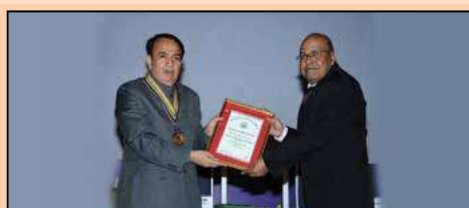
Deepak Fertilisers & Petrochemicals Corporation Ltd