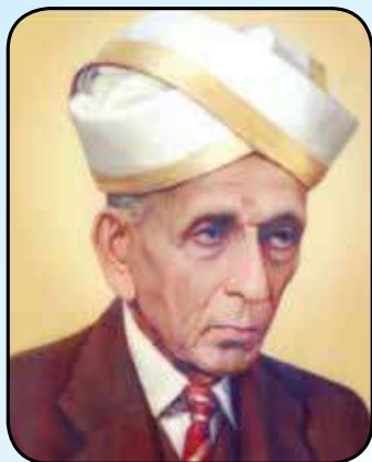
Bharat Ratna Sir M Visvesvaraya

September 15 is celebrated every year in the country since the year 1967 as "Engineers' Day" to commemorate the birthday of the legendary engineer Sir Mokshagundam Visvesvaraya. Sir Visvesvaraya, an eminent Indian engineer and statesman was born in a remote village of Karnataka, the State that is incidentally now the Hi-tech State of the country. Due to his outstanding contribution to the society, Government of India conferred "Bharat Ratna" on this legend in the year 1955. He was also called the precursor of economic planning in India. His learned discourse on Economic Planning in India, Planned Economy for India and Reconstructing India, was the first available document on the planning effort of the country and it is still held as the parent source matter for economic planners. A theme of national importance is chosen every year by the Council of the Institution and deliberated at its various State/Local Centres to educate the engineering fraternity in general and the society in particular. This year the 55 th Engineers' Day will be celebrated all over the country on the theme "Smart Engineering for a Better World".