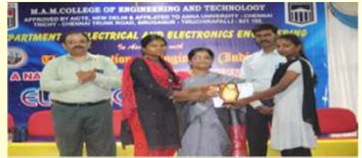
Prize distribution ceremony of the event

The IEI Students' Chapter, Electrical and Electronics Engineering Department of M.A.M College of Engineering and Technology organized an event "Technical Connection" on 16 March 2023.