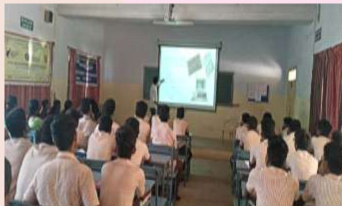
The speaker and the participants during the guest lecture 'Innovative Ideas in Industrial Automation'

Employees with their Work Procedure" on 5 February 2023, (iii) "Testing of Cement Concrete" on 17 March 2023, (iv) "Construction Chemicals" on 20 March 2023, (v) "Industrial Safety Management" on 30 January 2023, (vi) "Design of Chiller Plant" on 21 February 2023, (vii) "Innovation Techniques used in Air Conditioning System" on 23 February 2023 and (viii) 'Basics of Air Conditioning System' on 23 February 2023.