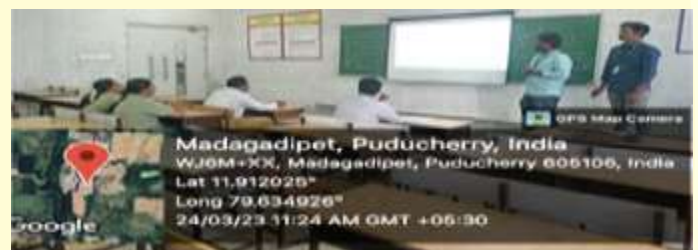
View of the participant during project presentation

The IEI Students' Chapter, Department of Instrumentation and Control Engineering of Sri Manakula Vinayagar Engineering College organized a Guest Lecture on "LPC2148 Microcontroller" on 21 February 2023. They also organized a "Project Presentation" on 24 March 2023.