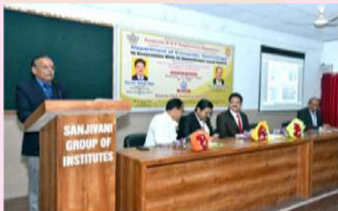
View of the dias during the inaugural session

The IEI Students' Chapter of Sanjivani KBP Polytechnic was inaugurated on 21 March 2023.