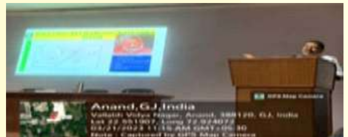
Glimpses of the event