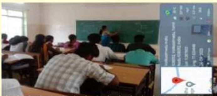
View of the speaker and the participants during the event

The IEI Students' Chapter, Department of Information Technology of Nandha College of Technology organized a Seminar on "Theory of Computation" on 24 April 2023.