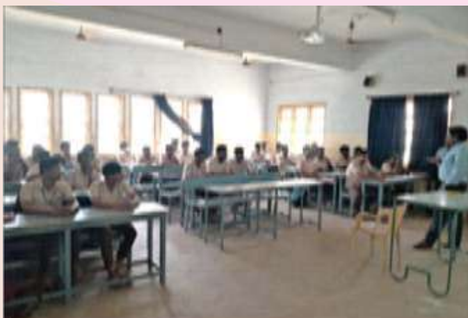
The speaker and the participants during the guest lecture 'Testing of Cement Concrete'