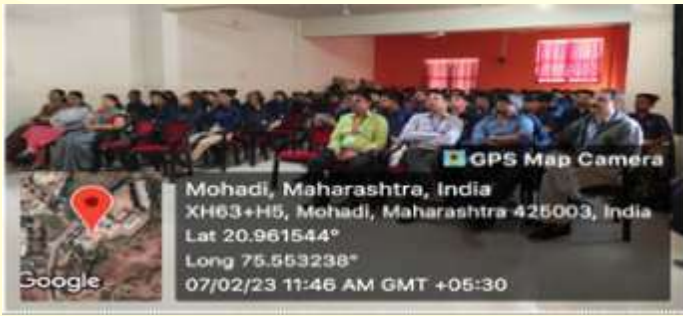
Speaker and the participants during the seminar

In addition to this, they conducted a Workshop on "Design Thinking, Critical Thinking and Innovation" during 27-28 January 2023.