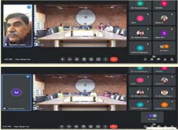
Screen-shot of the lecture

They also organized an online lecture on "Global Science for Global Well Being" on 1 March 2023.