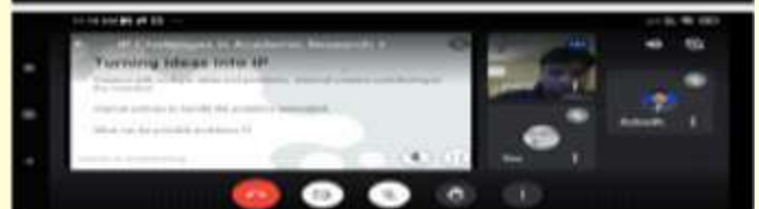
Screen-shot of the event