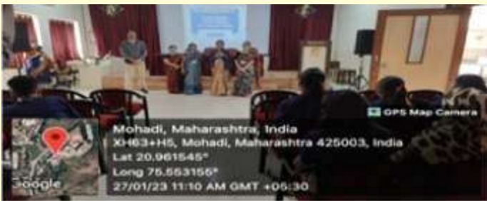
View of the dias during the workshop

In addition to this, they conducted a Workshop on "Design Thinking, Critical Thinking and Innovation" during 27-28 January 2023.