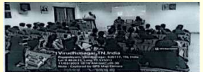
View of the speaker and the participants during the program

They also organized a one day Workshop on "Microsoft Dynamics 365 CRM and Power Platform (Power Apps)" on 11 February 2023.