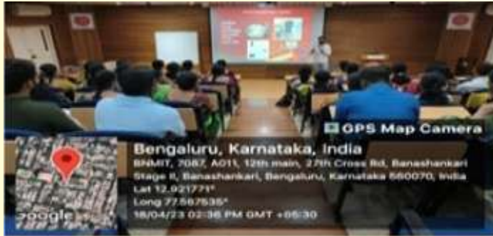
View of the speaker and the participants during the event

The IEI Students' Chapter, Electronics and Communication Engineering Department of B N M Institute of Technology organized a Workshop on "Research Proposals, Process Design and Development" on 18 April 2023.