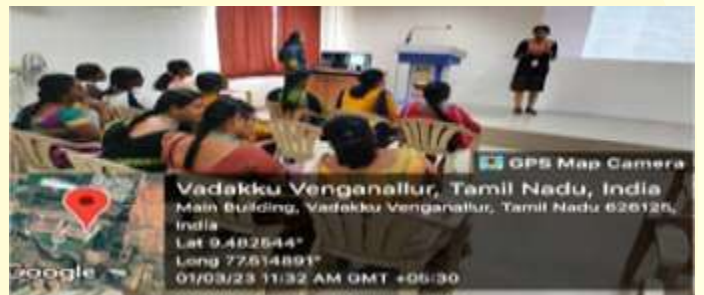
View of the participants and the speaker during the event

The IEI Students' Chapter, Department of Computer Science and Engineering Ramco Institute of Technology organized "Resume Building Contest" during 1-4 March 2023.