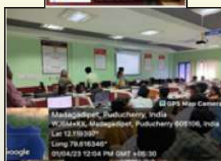
Glimpses of the Technical Session