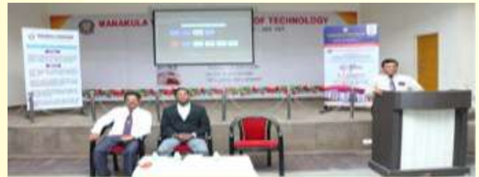
View of the dias during the program

The IEI Students' Chapter, Mechanical Engineering Department of Manakula Vinayagar Institute of Technology celebrated World Engineering Day on the theme "Engineering Innovation for a More Resilient" on 20 March 2023.