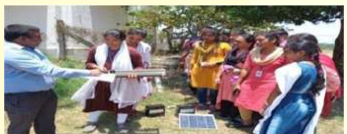
Participants during the workshop