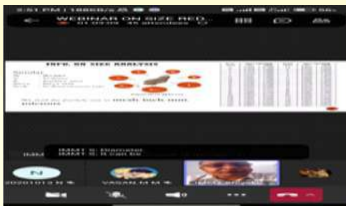
Screen-shot of the event

The IEI Students' Chapter, Chemical Engineering Department of Paavai Engineering College conducted a Webinar on "Size Reduction and Separation Techniques Applied in Industrial Process" on 6 March 2023.