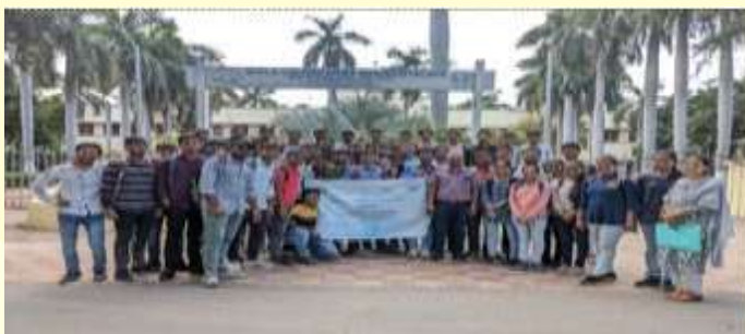
View of the participants during the technical tour

The IEI Students' Chapter, Civil Engineering Department of B.V.M. Engineering College arranges a Technical Tour to WALMI at Walmi Anand on 18 March 2023.