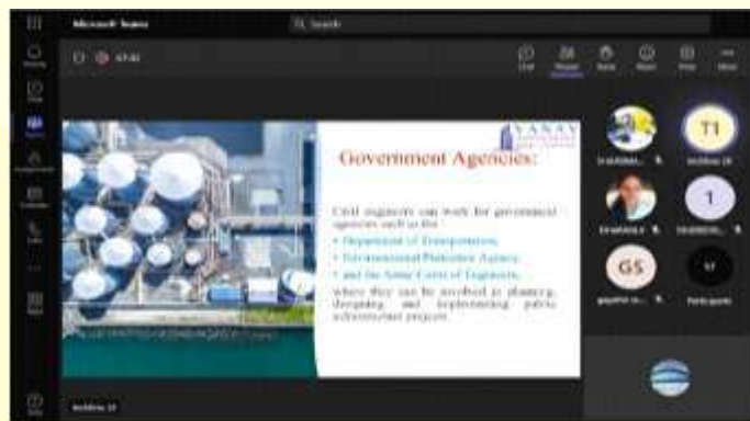
Screen-shot of the event

The IEI Students' Chapter, Civil Engineering Department of Paavai Engineering College organized Webinar on "Civil Engineering in Field Practice" on 14 March 2023.