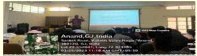
Speaker and the participants during the seminar

They also organized Seminars on "Structural Analysis" on 28 January, 25 February and 3 March 2023 and "Virtual Design & Building Information Medelling (BIM)" on 25 March 2023.