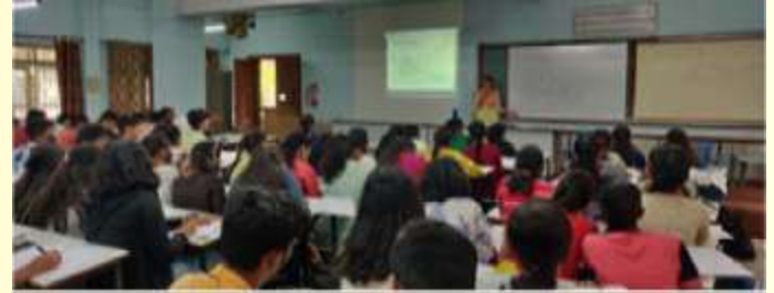
View of the participants and the speaker during the event

The IEI Students' Chapter, Electronics and Telecommunications Engineering Department of Cusrow Wadia Institute of Technology organized an Expert Lecture on "Applied Electronics-SCR Triggering and Commutation Circuits" on 16 March 2023.