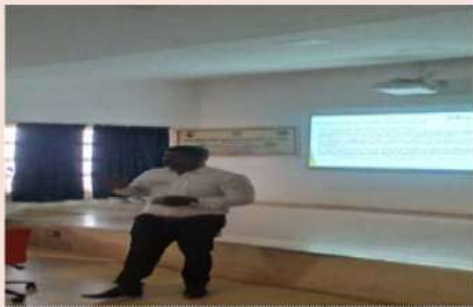
The speaker during the guest lecture "Design of Chiller Plant"