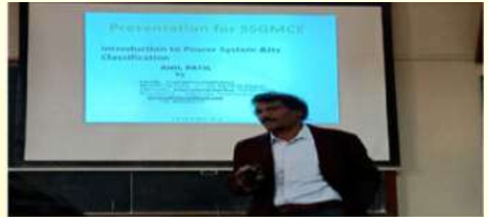
View of the speaker during the event

They also organized Two Days Workshop on "Power Distribution, Automation and SCADA System" during 21-22 February 2023.