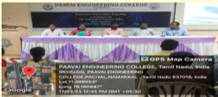
View of the dias during the lecture

The IEI Students' Chapter, Information Technology Department of Paavai Engineering College organized one day Guest Lecture on "Emerging Trends in IT" on 17 March 2023.