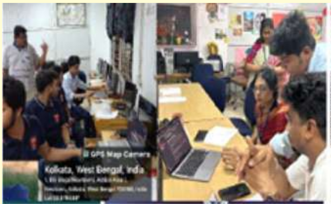
Glimpses of the event