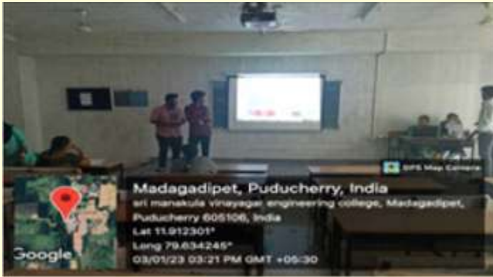
View of the participants during the poster presentation

They also organized a Poster Presentation on "Role of Artificial Intelligence in Healthcare Systems" held on 3 January 2023, "Cyber Security Training" on 7 March 2023, "Placement Training" on 31 March 2023 and "Aptitude Training" on 27 March 2023. They organized an event "Ideathon" on 7 January 2023.