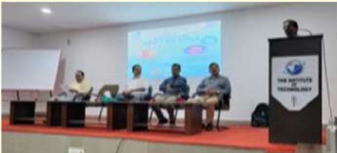
View of the dias during the event

The IEI Students' Chapters of Civil and Mechanical Engineering Department of TKM Institute of Technology conducted workshop on "World Water Day" on 22 March 2023.