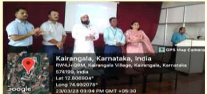
View of the dias during the program

The IEI Students' Chapter, Department of Environment Engineering, P A College of Engineering observed World Water Day – 2023 by conducting an invited talk on "Save Water-Be The Change You Want to See" on 23 March 2023.