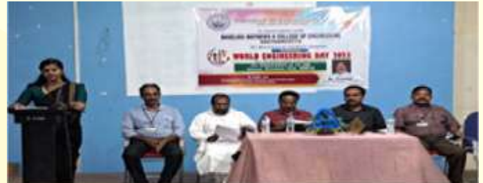
View of the dias during the event

The IEI Students' Chapter, Mechanical Engineering Department of Baselios Mathews II College of Engineering observed "World Engineering Day 2023" on 6 March 2023.