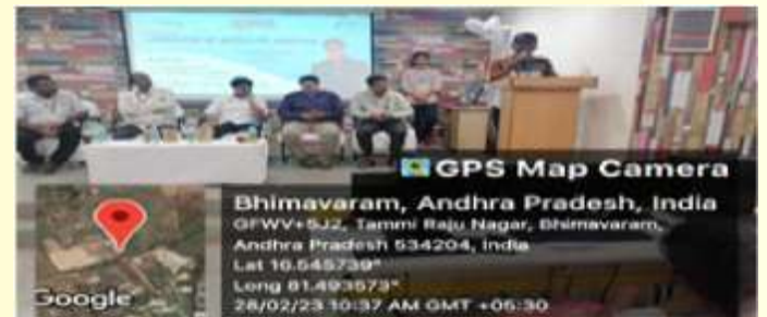
View of the dias during the program

The IEI Students' Chapter, Department of Computer Science and Design of Sagi Ramakrishnam Raju Engineering College inaugurated on 21 February 2023. They organized an Expert Talk on "Launching of Satellite Vehicles" on National Science Day on 28 February 2023.