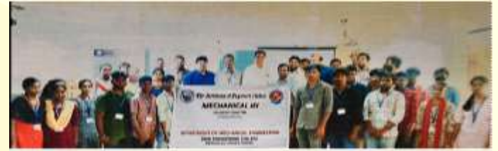
View of the participants during the inaugural program

The IEI Students' Chapter, Department of Mechanical Engineering of Sagi Ramakrishnam Raju Engineering College was inaugurated on 15 March 2023.