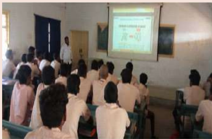
The speaker and the participants during the guest lecture 'Basics of Air Conditioning System'

The Chapter also conducted a 'Technical Symposium' on 30 January 2023, a National Level Technical Symposium "AURA – 2K23" on 17 March 2023 and on "PACR TECHFEST 2023" on 24 February 2023.