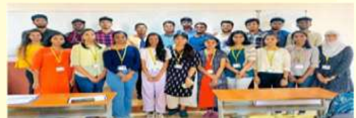
Participants of the technical fest

The IEI Students' Chapter, Department of Electrical and Electronics Engineering of Dayananda Sagar College of Engineering organized a "Technical Fest" on 17 March 2023.