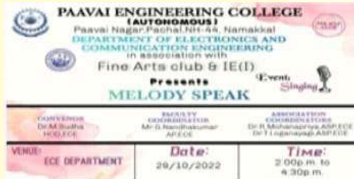
Flyer of the event

The IEI Students' Chapter, Electronics and Communication Engineering Department, Fine arts club of Paavai Engineering College organized an event "Melody Speak" on 29 October 2022.