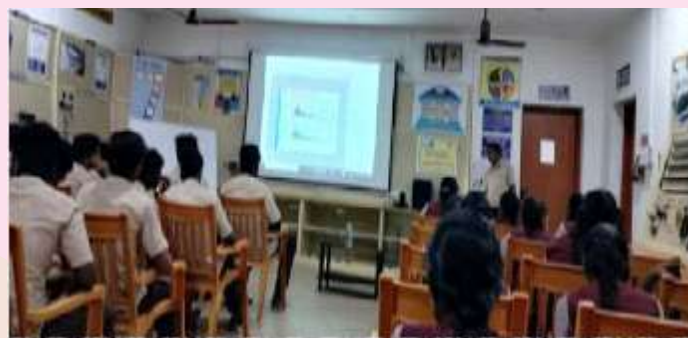
The speaker and the participants during Training Programmes on "Spectrogram Analysis"

They also organized Paper Presentations on (i) "Renewable Sources of Energy" on 7 March 2023, (ii) 'Electronics and Communication Engineering' on 26 January 2023, (iii) "Technical Textiles" on 24 February 2023, and (iv) "Innovative Textile Products in Various Sector" on 23 February 2023.