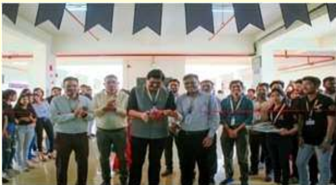
View of the participants during the program