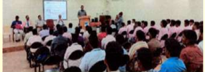
View of the dias and the participants during the inauguration

The IEI Students' Chapter, Mechanical Engineering Department of M.I.E.T Engineering College was inaugurated on 5 April 2023.