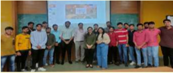
Participants during the program