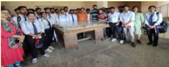
Participants during the program

They also conducted a Plant Visit at 'Garden Reach Wastewater Treatment Plant' on 30 March 2023.