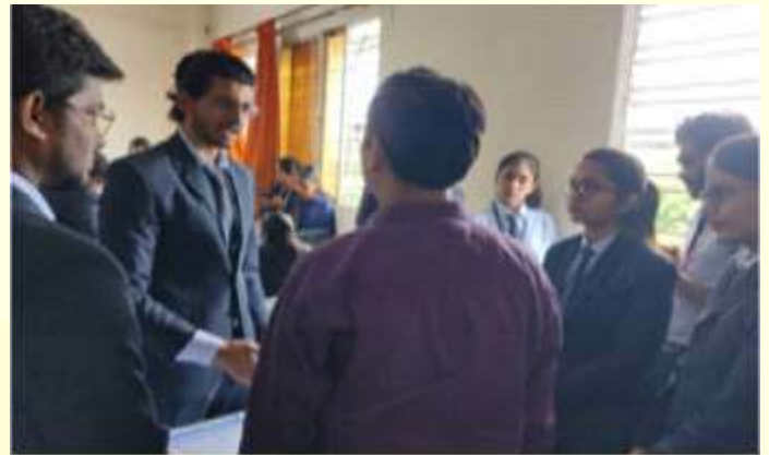
Glimpses of the event