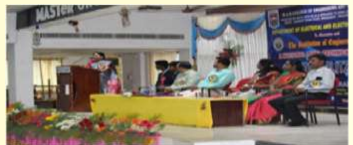
Lighting of the lamp and view of the dias during the symposium