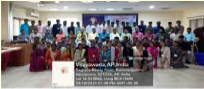
Lighting of the lamp and the participants during the inaugural session of the event