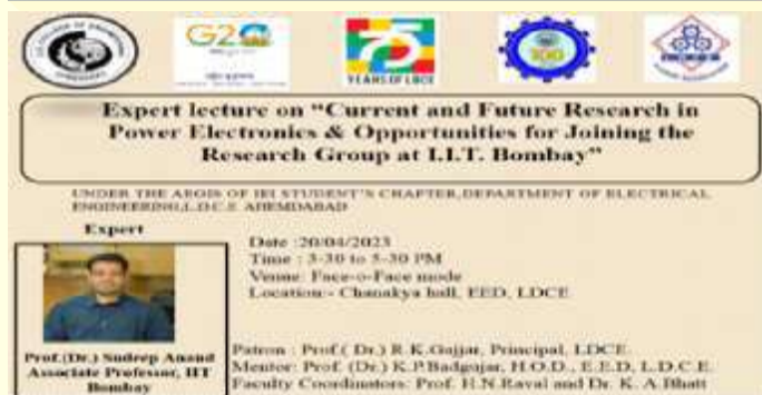
Flyers of the expert lectures