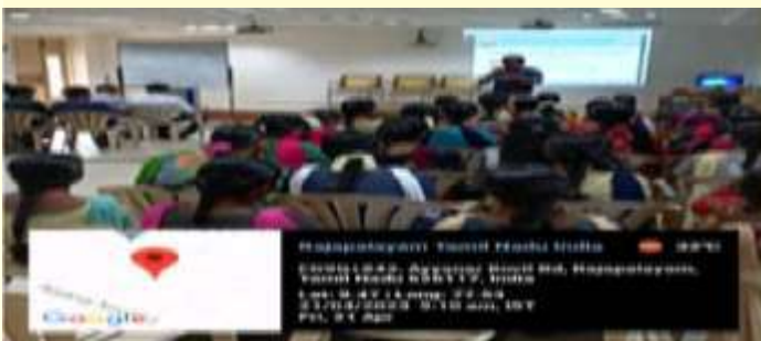
View of the dias and the speaker during the lecture program