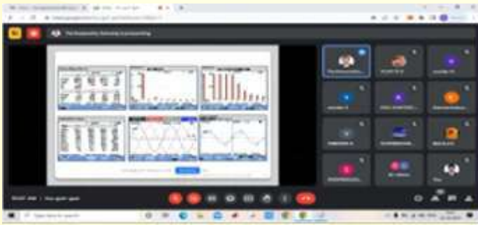
Screen-shot of the event

The IEI Students' Chapter, Department of Electronics and Communication Engineering of Ramco Institute of Technology organized a Guest Lecture on "Project Based Learning: Learn through Innovation" on 21 April 2023.