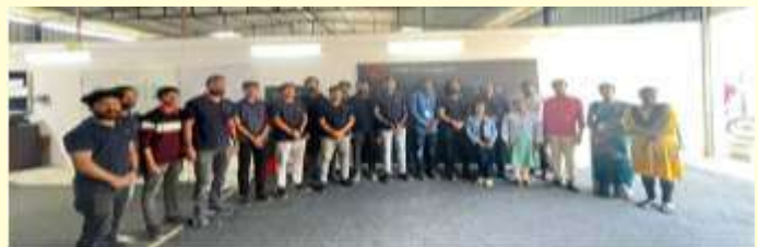
Participants during the visit

The IEI Students' Chapter of Electrical and Electronics Engineering Department of the Institute organized Industrial Visit at Starya Mobility Pvt Ltd, Bangalore on 27 January 2023.