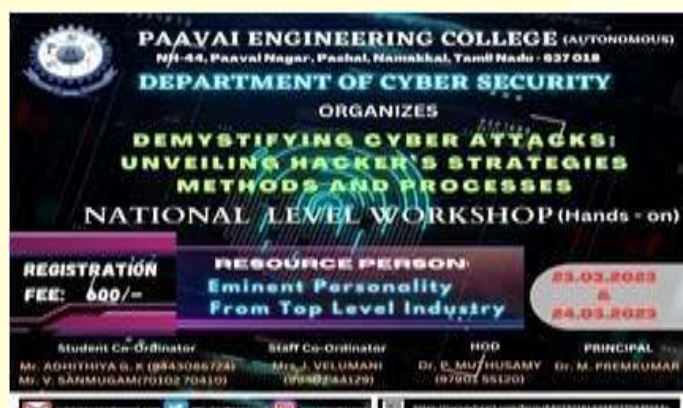
Flyer of the seminar

The IEI Students' Chapter, Cyber Security Department of Paavai Engineering College organized two days National Level Seminar on "How to Plan for Startup and Legal & Ethical Steps" during 23-24 March 2023.