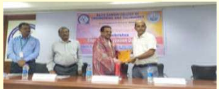
View of the dias during the event

The IEI Students' Chapter, Departments of Biomedical Engineering, Electrical Engineering and Mechanical Engineering of Rajiv Gandhi College of Engineering and Technology organized a "Energy Conservation Day – 2023" on 12 January 2023.