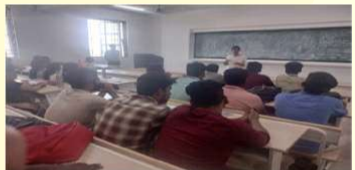
View of the speaker and the participants during the program

The IEI Students' Chapter, Department of Information Technology of the same institute organized a Guest Lecture on "Metaverse Technology" on 24 March 2023.