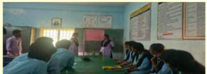
Participants during the event