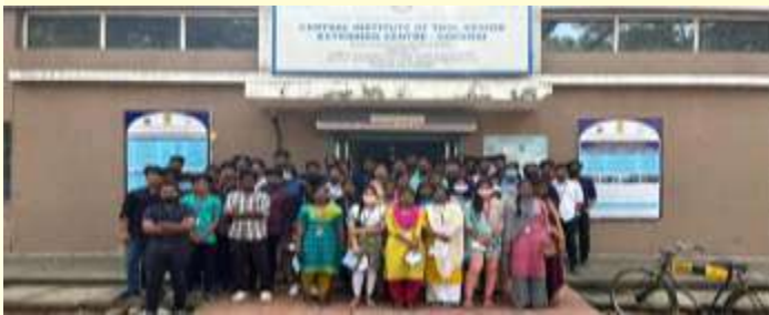
Participants during the trip

The Chapter also organized a visit to a Central Institute of Tool Design Extension Centre on 15 February 2023.