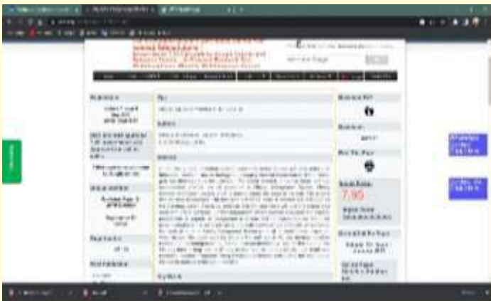
Screen-shot of the event

The IEI Students' Chapter of Department of Computer Science and Business Systems conducted an orientation program on "Python and its Applications" on 6 January 2023 and a Workshop on "Automobile Trouble Shooting" organized on 20 March 2023.