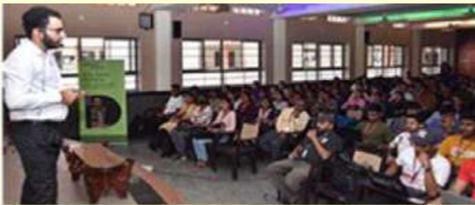
Speaker of the event

They also organized a bootcamp on "AI essentials Under Intel AI for Future workforce Initiatives" on 6 March 2023.