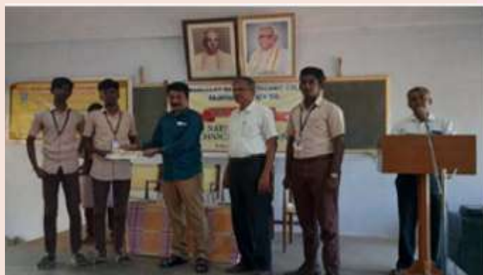
View of the dias during 'PACR TECHFEST 2023'

A Pre-Placement Training Program was conducted on 24 January 2023.