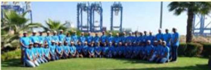
The view of power plant and the participants

They also organized online Expert Lectures on "Recent Trends in Industrial Switchgear" during 24 March 2023 and on "Current and Future Research in Power Electronics & Opportunities for Joining the Research Group at I.I.T Bombay" on 20 April 2023.