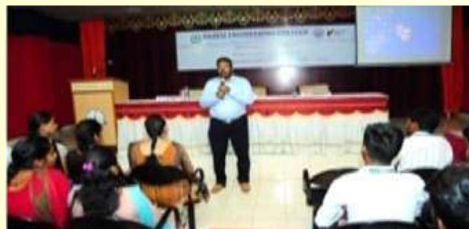
View of the speaker during the lecture

The IEI Students' Chapter, Computer Science and Engineering Department of Paavai Engineering College organized a Guest Lecture on "Python for Data Science, AI and ML Development" on 18 March 2023.