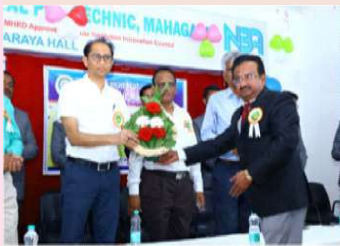
View of the dias during the event

The IEI Students' Chapter of SGM Rural Polytechnic organized a "Technical Paper Presentation" and a National Level Competition "Anuttara" on 1 April 2023.