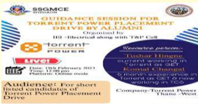
Flyer of the event

The IEI Students' Chapter, Department of Electrical Engineering of Shri Sant Gajanan Maharaj College of Engineering organized an Expert Talk on "Guidance Session for Torrent Power Placement Drive" on 19 February 2023.