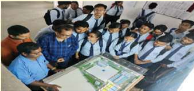
Participants during the program

The IEI Students' Chapter, Civil Engineering Department of Budge Budge Institute of Technology has conducted a Plant Visit at "210 MGD Water Treatment Plant at Garden Reach" on 23 February 2023.