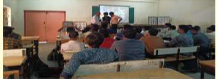
View of the speaker and the participants during the workshop

The IEI Students' Chapter of Mechatronics Department of the Institute organized a workshop on "Laser Cutting" on 6 February 2023 and on "Electronic Devices Trouble Shooting" on 2 March 2023.