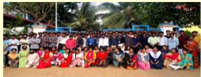
Participants during the visit

They organized another Industrial Visit at Pentagon Switchgear, Coimbatore on 3 February 2023.