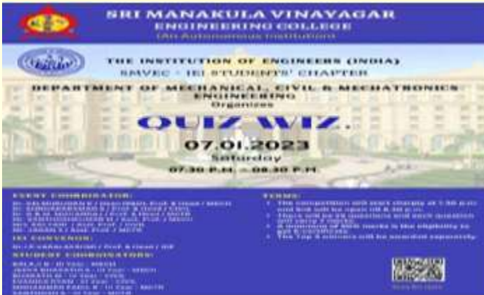
Flyer of the event

The IEI Students' Chapter of Department of Mechanical, Civil and Mechatronics Engineering organized "Quiz Wiz" on 7 January 2023.