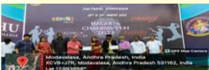
View of the dias during the program

The IEI Students' Chapter, Civil Engineering Department of Raghu Engineering College organized a Technical Fest "REIN4Z 2K23" during 20-21 March 2023.