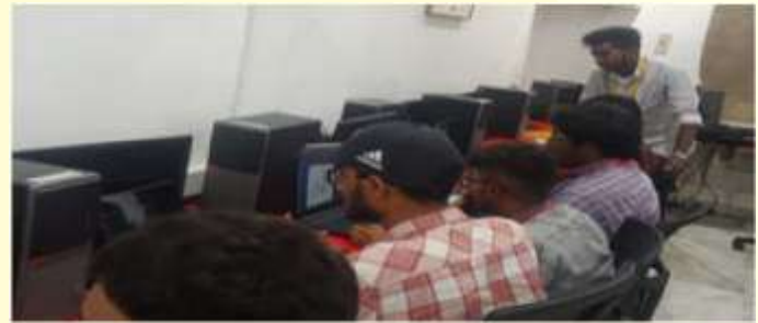
View of the participants during the workshop

The IEI Students' Chapter, Computer Science and Engineering Department of Sathyabama Institute of Science and Technology conducted a workshop "Graphic Design" on the topic "How to Use Computer Graphic in Real Time" during 24- 29 March 2023.