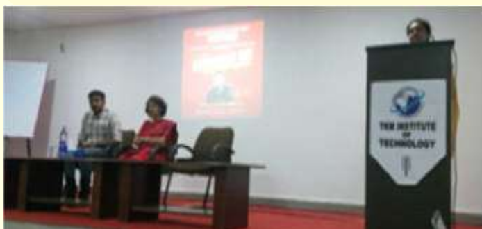
View of the dias during the event

The IEI Students' Chapter, Civil Engineering Department of TKM Institute of Technology observed World Engineering Day on the theme "Engineering Innovation for a More Resilient World" on 3 March 2023.