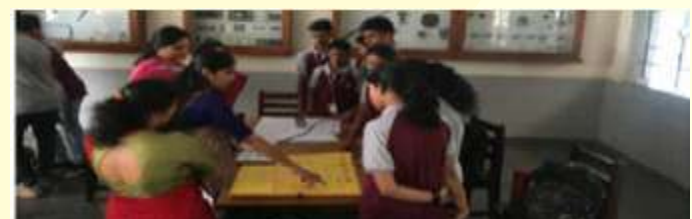
Participants during the program