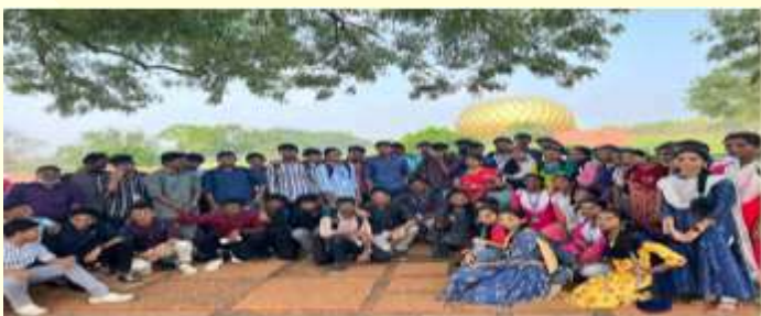
Participants during the field trip

They also organized a One Day Field Trip to Auroville Electrical Services, Puducherry on 7 January 2023.