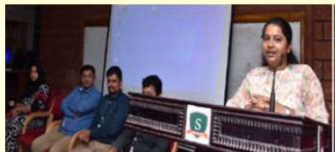
Glimpses of the workshop