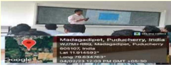
The speaker during the seminar on 'Biomedical Instruments'

The Chapter also organized a visit to a Central Institute of Tool Design Extension Centre on 15 February 2023.