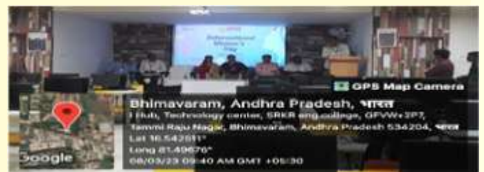
View of the dias during an event

They organized an online Quiz Competition on 28 February 2023, a "Technical Spell Bee Contest" on 25 March 2023, a "Startup Spark" on 25 March 2023 and celebrated "International Women's Day" on 8 March 2023.