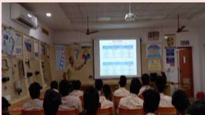
The speaker and the participants during Training Programmes on "Fibre Testing Instruments"

They also organized Training Programmes on "Fibre Testing Instruments" on 28 January 2023 and "Spectrogram Analysis" on 18 March 2023.