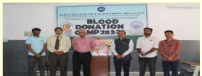
View of the dias

The IEI Students' Chapter, Electrical & Electronics Engineering Department of Jain College of Engineering organized "Blood Donation Camp" on 28 March 2023.