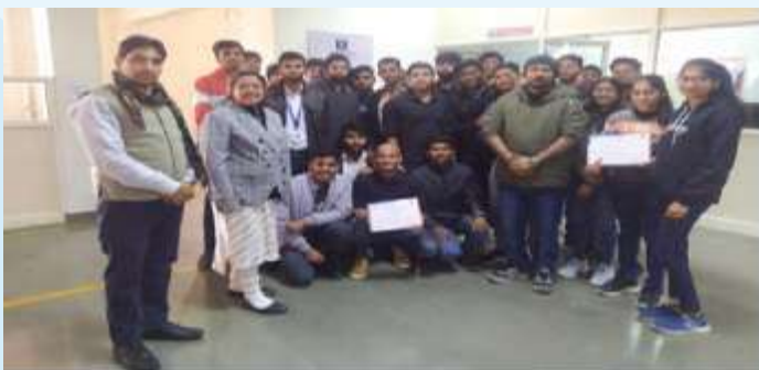
Participants during the program

The IEI Students' Chapter of Anand International College of Engineering organized a One Day Hands-on Workshop on "3D Printing" on 21 January 2023.