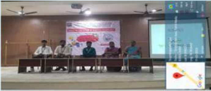
View of the dias during the seminar

M.A.M.College of Engineering and Technology organized One Day Seminar on "The Future of Robotics Technology" on 17 February 2023.