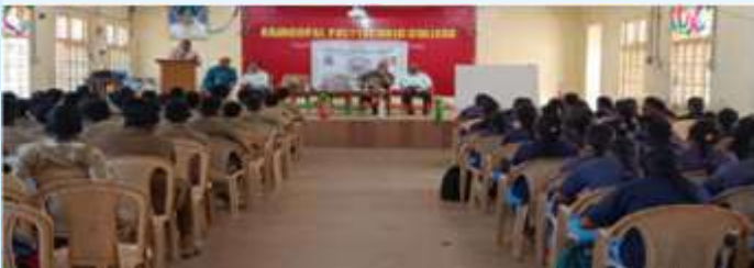
View of the speaker and participants during the program

The IEI Students' Chapter, Rajagopal Polytechnic College organized a Seminar on "Employability Skill, Knowledge & Experience" on 27 February 2023.