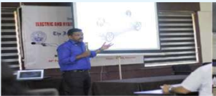
View of the apeaker during the seminar

The IEI Students' Chapter, Mechanical and Electrical Engineering Department of NSS College of Engineering conducted a seminar on "Electric and Hybrid Vehicle" on 24 February 2023.