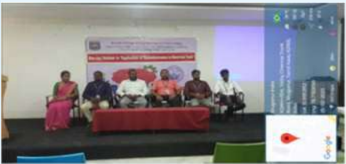
View of the dias during the seminar

The IEI Students' Chapter also organized One Day Seminar on "Application of Nanoelectronics in Electrical Field" on 25 February 2023.