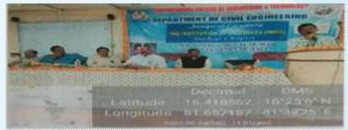
View of the dias during the program

The IEI Students' Chapter, Civil Engineering Department of Swarnandhra College of Engineering and Technology was inaugurated on 4 February 2023.