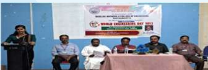
View of the dias during the program

The IEI Students' Chapter, Mechanical Engineering Department of Baselios Mathews II College of Engineering celebrated World Engineering Day 2023 on 6 March 2023.