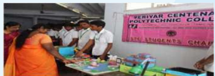
View of participants during the program

The IEI Students' Chapter of Periyar Centenary Polytechnic College organized Project Exhibition namely "Periyar TechnoExpo-2023" on 13 January 2023.