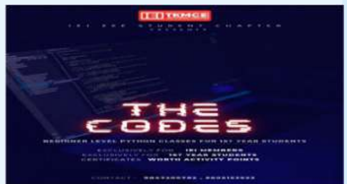
Flyer of the program

The IEI Students' Chapter, Electrical Engineering Department of TKM College of Engineering conducted workshop on beginner lever python programming namely "The Code" on 30 November 2022 for three days for offline and online on 3 December 2022.