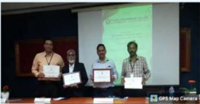
View of the dias

The IEI Students' Chapter, Department of Mechanical Engineering of Raghu Engineering College was inaugurated on 29 December 2022.