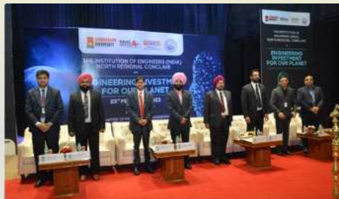
View of the dias