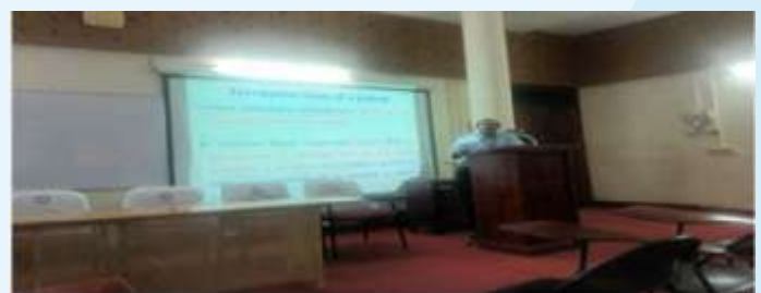
View of speaker during the program

The Chapter also organized an Expert Talk on "An Introduction to Patent Filing" on 27 February 2023.