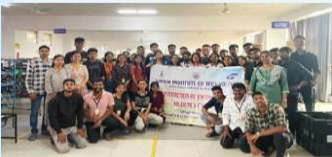
View of participants during the program

They also conducted a webinar on "Understanding FPGAs for Industrial Applications-Step towards Career Path in Semiconductor Industries" on 10 December 2022 and a Quiz Competition on "Inquizitive" on 15 December 2022.