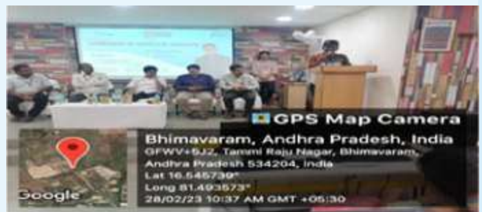
View of the dias during the program

The IEI Students' Chapter of S R K R Engineering College organized an Online Quiz Competition on behalf of National Science Day during 28 February 2023 and an "Expert Talk on Launching of Satellite Vehicles" on National Science Day during 28 February 2023.