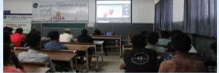
View of the dias during the program

The IEI Students' Chapter, Electrical & Electronics Engineering Department of Jain College of Engineering celebrated National Science Day on 28 February 2023.