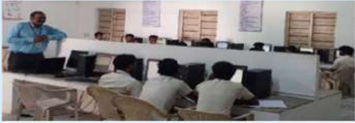
View of participants during the workshop