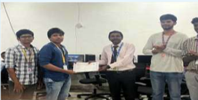
View of participants during the program

The Chapter conducted a contest on "Web Development [Front Eng]" namely "To Create Event Website or Personal Portfolio or Health Tips and Wellness" on 17 February 2023.