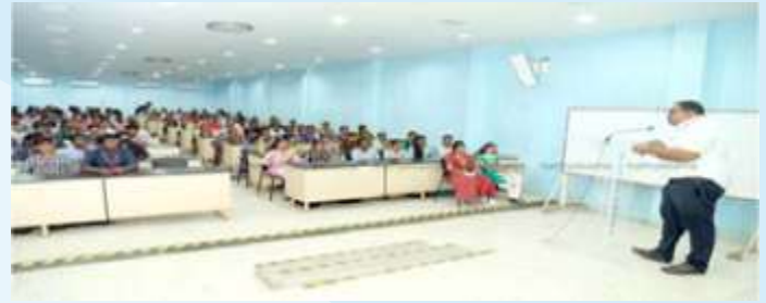
View of participants during the program

Synchronization" on 7 July 2022. The Chapter also organized Seminar on "Design of Controller for Unified Power Flow Conditioner" on 16th February 2023.