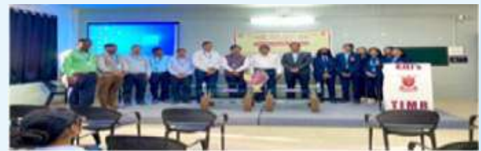
View of the dias during the inauguration program

The IEI Students' Chapter of Trinity Polytechnic was inaugurated on 16 February 2023.