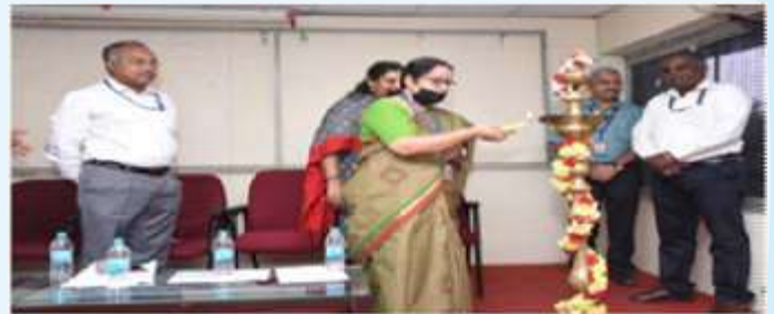
Lighting of the lamp during the program

The IEI Students' Chapter, Department of Aerospace Engineering of SRM Institute of Science and Technology organized one day national seminar on "Trends on Future of Aviation" on 8 March 2023.