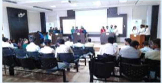
View of participants during the program

The IEI Students' Chapter of Anand International College of Engineering celebrated "National Science Day(NSD)" followed by guest lecture, project exhibition and technical quiz competition on 28 February 2023.