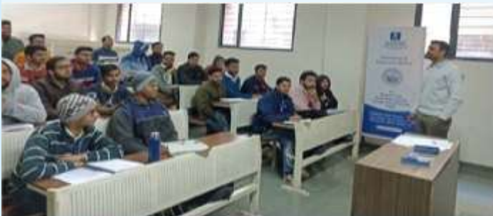
View of the speaker and the participants during the lecture programme

The IEI Students' Chapter of Anand International College of Engineering organized a four day Lecture Series (Technical) on "Programming for Data Science" during 3-6 January 2023.