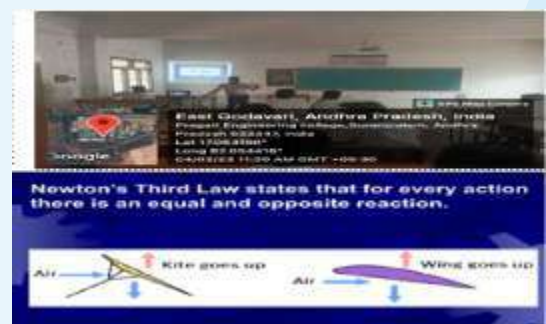
View of speaker during the program