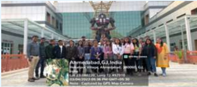
View of the participants

The IEI Students' Chapter, Civil Engineering Department of B V M Engineering College organized a Technical Visit to L & T Construction Skills Training Institutes (CSTI) and Science Carnival 2023, Ahmedabad on the subject "2 CE05-Construction Technology" on 4 March 2023.