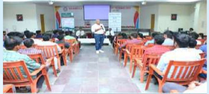
View of the speaker and the participants during the lecture

The IEI Students' Chapter, Mechanical Engineering Department of Manakula Vinayagar