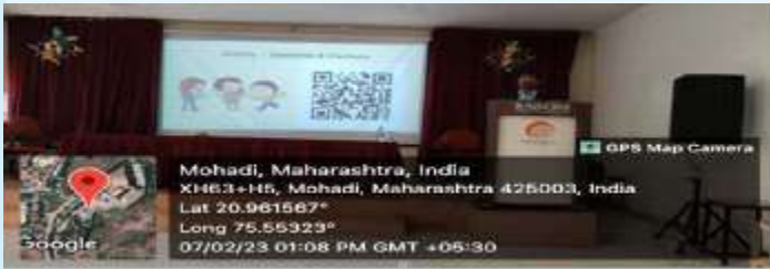
View of the speaker during the talk

The IEI Students' Chapter, CSE-IT-DS-AI Departments of G H Raisoni Institute of Engineering and Business Management organized an Industrial Talk on "Business Incubators for First Generation Entrepreneurs" on 7 February 2023.