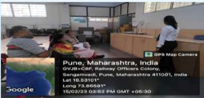
View of participants during the program

The IEI Students' Chapter, Electronics & Telecommunication Engineering Department of AISSMS College of Engineering conducted a Technical Demonstration on 15 February 2023.