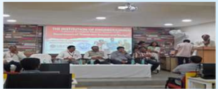
View of the dias during the inauguration

The IEI Students' Chapter, Computer Science & Design Engineering Department of S R K R Engineering College was inaugurated on 21 February 2023.