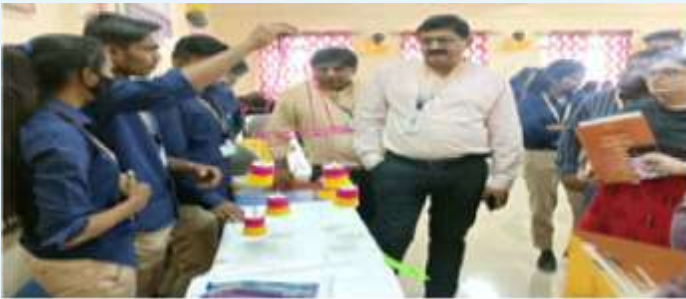
View of participants during the program

The IEI Students' Chapter, Electrical Engineering Department of G H Raisoni Institute of Engineering Technology organized Expert Lecture on "Cyber Psychology and Darker Side of Social Media Platforms" on 27 February 2023 and an Exhibition on "Best from Waste" on 28 February 2023.