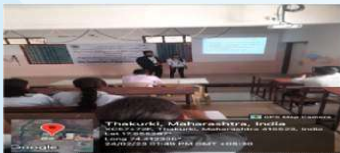
View of participants during the program