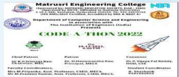
Flyer of the event

The IEI Students' Chapter, Computer Science & Engineering Department of Matrusri Engineering College organized an Online Event "CODE-A-THON" on coding contest on C Programming, Python Programming, Java Programming on 26 December 2022.