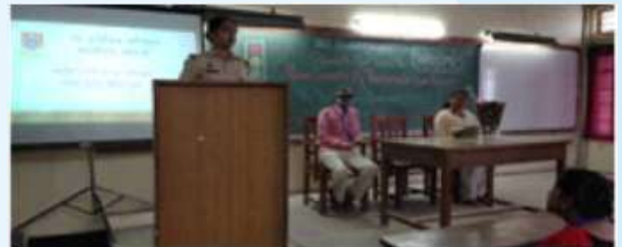
View of the dias during the event

The IEI Students' Chapter of Government Polytechnic organized Expert Lecture, Industrial Visit, Technical Quiz Competition and Technical Events.