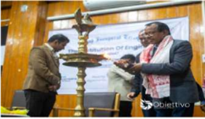
View of lighting of the lamp during the inauguration