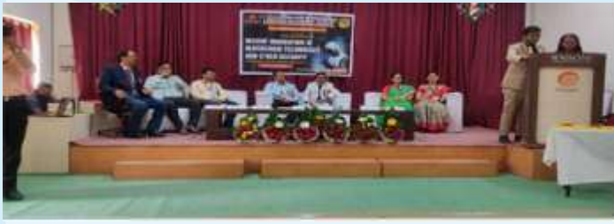
View of the dias during the program

The IEI Students' Chapter, CSE-IT-DS-AI Departments of G H Raisoni Institute of Engineering and Business Management organized an Industrial Talk on "Business Incubators for First Generation Entrepreneurs" on 7 February 2023.