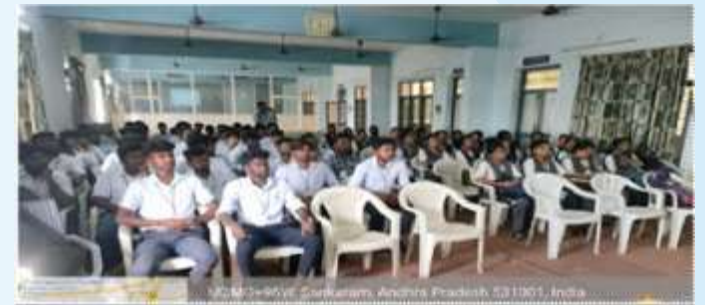
View of participants during the program