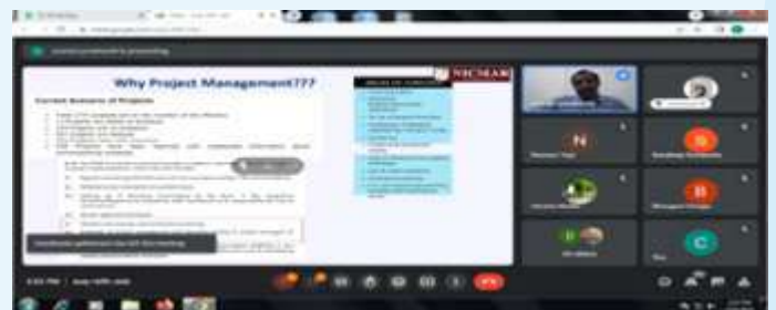
Screenshot of the webinar

The IEI Students' Chapter also organized a webinar on "Scope of Engineering Graduates in the Techno-Management Sector" during 10 February 2023, 20- 22 February 2023.