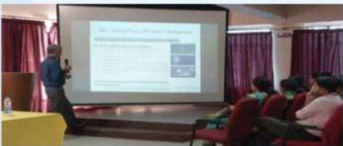
View of speaker during the program

The IEI Students' Chapter, Department of Computer Science & Engineering of Sapthagiri College of Engineering conducted Technical Talk on "5G Technology" on 3 January 2023.