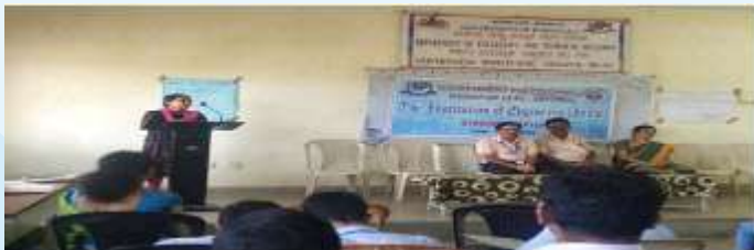
View of the dias

The IEI Students' Chapter of Government Polytechnic organized Technical Exhibition and Quiz Competition on 5 January 2023.