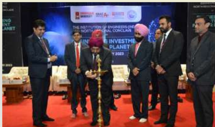
Lighting of the lamp during the inaugural session

Second Regional Conclave of Students' Chapter of The Institution of Engineers (India) was organized on the theme 'Engineering Investments for Our Planet' on 23 February 2023 hosted by Chandigarh University in association with Punjab & Chandigarh State Centre and Ludhiana Local Centre.