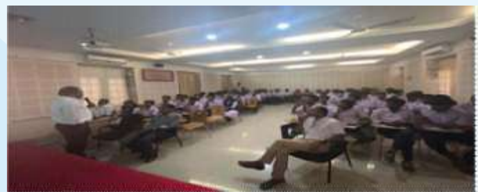
View of the speaker and the audience during the program

The IEI Students' Chapter, Mechanical Engineering Department of NSS College of Engineering and The Society of Automotive Engineers(SAE) organized a Workshop on "Excavators" on 7 March 2023.