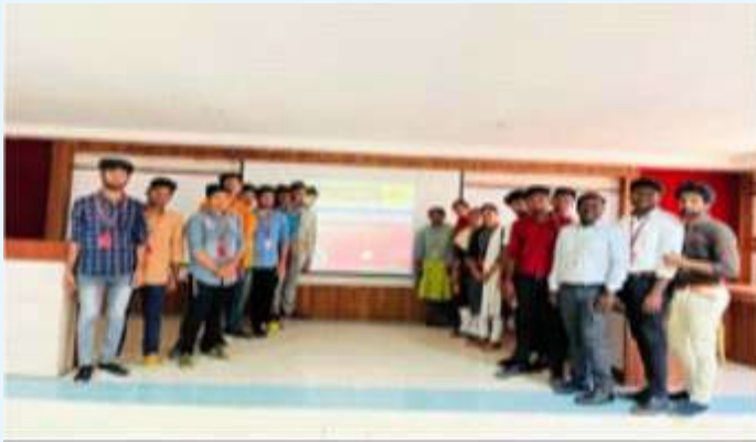
View of participants during the program

The IEI Students' Chapter, Electronics and Communication Engineering Department of Narayana Engineering College conducted a Technical Quiz "Henrich Rudolf Hertz Day" on the occasion of Hertz's 166th Birthday during 22- 23 February 2023.