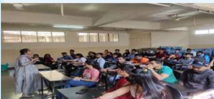
View of speaker and the participants during the program

The IEI Students' Chapter organized a seminar on "How to Write Research Paper" on 15 February 2023.