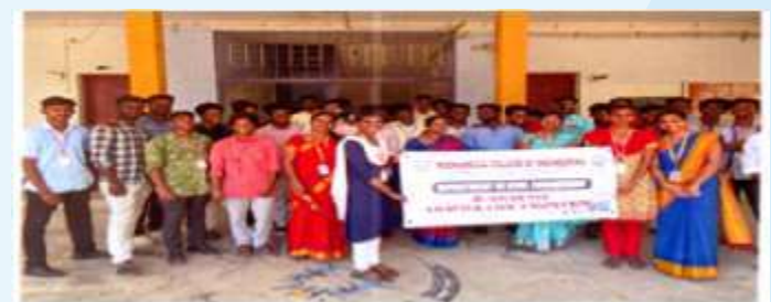
View of participants during the lecture program

The IEI Students' Chapter, Civil Engineering Department of Mookambigai College of Engineering conducted a Special Lecture on "Recent Trends in Civil Engineering" on 21st February 2023.