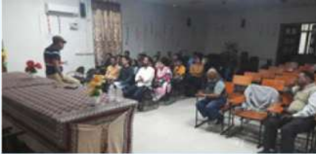
View of the speaker and the participants during the lecture

The IEI Students' Chapter, Electrical Engineering Department of L D College of Engineering organized Expert Lecture on "Application of Controlled Switching in Power System" on 10 January 2023.