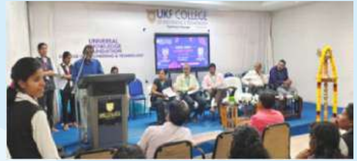
View of lighting of the lamp and the dias