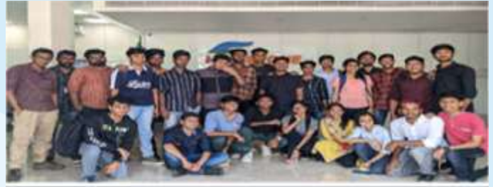
View of the participants

Engineering conducted an Industrial Visit to Hail Stone Innovations on 17 December 2022.