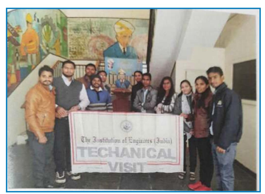
Views of the participants during technical visits

The Rajasthan Technicians' Chapter organized three Committee Meetings. The Chater also organized three group discussions and two technical visits, two technical quizzes and three get togethers during the month December 2019 to April 2020.