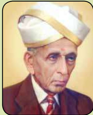
Bharat Ratna Sir M Visvesvaraya

September 15 is celebrated every year in the country since the year 1967 as "Engineers' Day" to commemorate the birthday of the legendary engineer Sir Mokshagundam Visvesvaraya. Sir Visvesvaraya, an eminent Indian engineer and statesman was born in a remote village of Karnataka, the State that is incidentally now the Hi-tech State of the country. Due to his outstanding contribution to the society, Government of India conferred "Bharat Ratna" on this legend in the year 1955. He was also called the precursor of economic planning in India. His learned discourse on Economic Planning in India, Planned Economy for India and Reconstructing India, was the first available document on the planning effort of the country and it is still held as the parent source matter for economic planners. A theme of national importance is chosen every year by the Council of the Institution and deliberated at its various State/Local Centres to educate the engineering fraternity in general and the society in particular. This year the 58 th Engineers' Day will be celebrated all over the country on the theme " Deep Tech & Engineering Excellence: Driving India's Techade ".