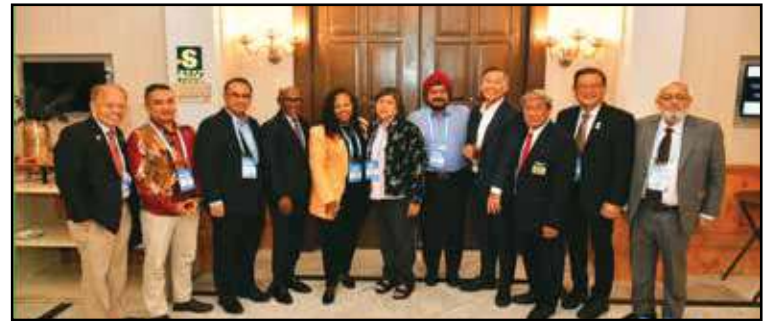
SDG networking with representatives from other countries

On 11 th June 2025, the Combined Open Agreement Meeting continued to finish the business. The day concluded with closed Business Meeting on IPEA.