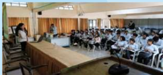
Glimpse of the event

They also conducted a Technical Expert talk on "Construction of Bituminous Pavement" on 23 July 2024.