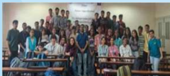
Participants of the event

The IEI Students' Chapter, Department of Electrical Engineering organized a Workshop on "Arduino" on 12 August 2024.