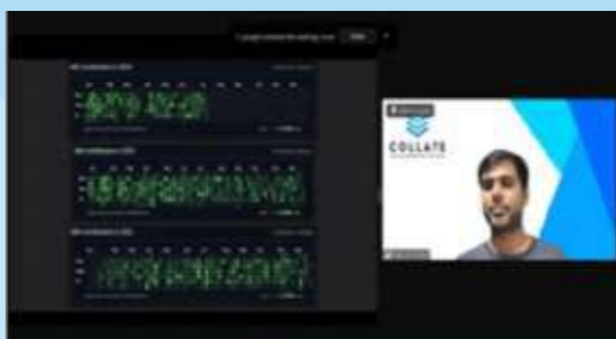
Screenshot of the event

The IEI Students' Chapter organized a Webinar on "Opensource and LinkedIn" on 20 July 2024.