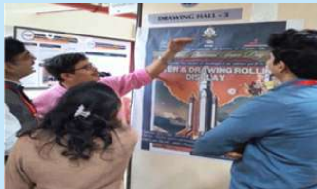
Faculties and guest discussing the event

The IEI Students' Chapter also organized a Digital Poster and Model Making Competition to celebrate the success of the Chandrayaan-3 Mission and commemorate National Space Day on the theme "Touching Lives while Touching the Moon: India's Space Saga" on 23 August 2024.