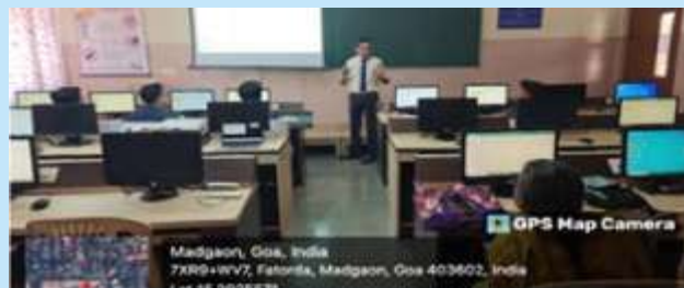
View of the speaker during the event

The IEI Students' Chapter of Department of Mechanical Engineering organized a Short Term Training Program on 'Six Sigma for Improved Quality Management' during 13- 17 May 2024.