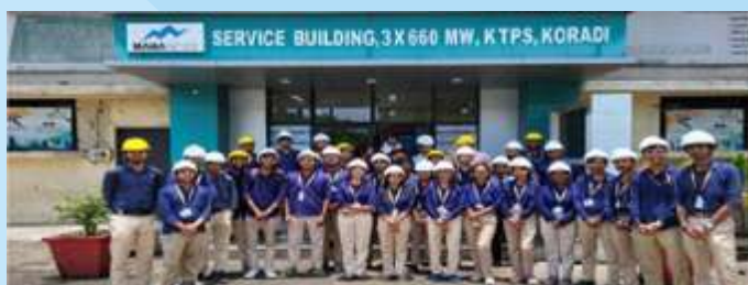
View of participants during Industrial Visit

They organized a Expert Lecture on "Career opportunities after Civil Engineering" on 09 August 2024.