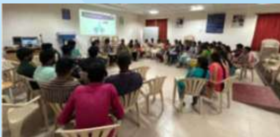
Participants attending the guest lecture

The IEI Students' Chapter Department of Computer Science and Engineering organized a guest lecture titled "Campus to Corporate - How HRM Facilitates the Transition" on 22 August 2024.