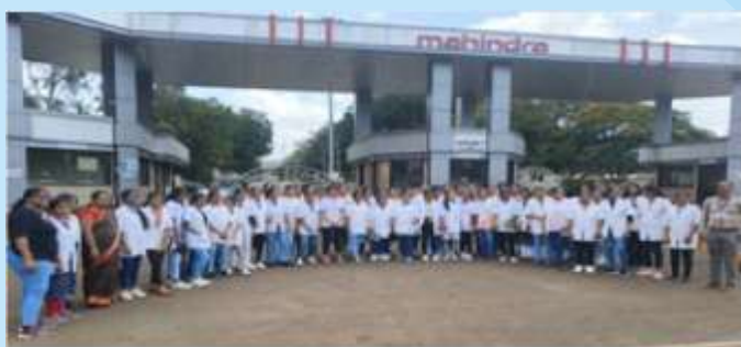
View of the participants during Industrial Visit

The IEI Students' Chapter organized an Industrial Visit to Mahindra and Mahindra Automobile Company, Zaheerabad on 10 July 2024.