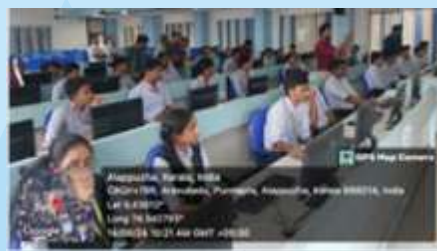
Glimpse of the event

The IEI Students' Chapter, Department of Mechanical Engineering as part of "National Space Day 2024" conducted a "Robotic Arm Workshop -Lunar Sample Collection" on 14 August 2024.