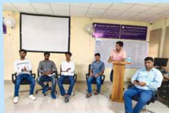
Glimpse of the Group Discussion

The IEI Students' Chapter, Department of Electrical Engineering, organized a one-day Aptitude Test Competition and Group Discussion event on 20 July 2024.