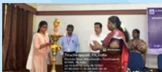
Inauguration of the Chapter

The IEI Students Chapter of Department of Computer Science and Engineering was inaugurated on 30 July 2024.