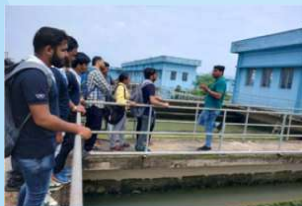
Glimpses of the Plant Visit

The IEI Students' Chapter organized a Plant Visit to 30 MGD Water Treatment Plant at Jai Hind Jol Prokolpo, Science City Dhapa, Kolkata on 14 August 2024