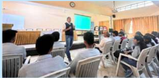
Glimpse of the expert talk

The Chapter also organised a Guest Lecture on "Interview Skills & Resume Building" on 09 July 2024 and an Industrial Visit to Koradi Thermal Power Station on 19 July 2024.