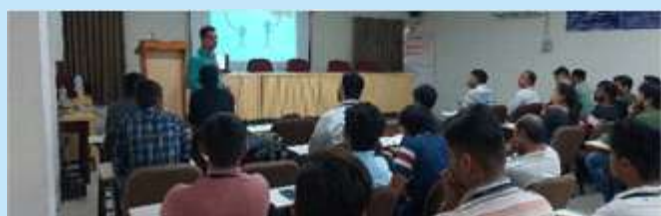
Participants in the event

The IEI Students' Chapter, Department of Civil Engineering also organized an event on "Engineering Experimental Analysis using Minitab" on 24 July 2024.