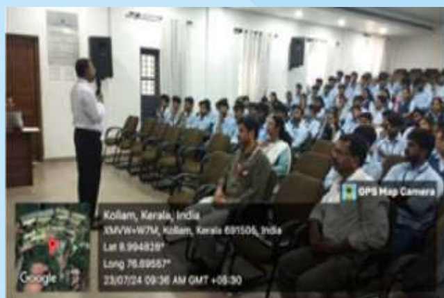
View of the speaker addressing the participants

The IEI Students' Chapter, Department of Computer Science and Engineering organized a Seminar on "Launching Your Career from Campus to Corporate" on 23 July 2024.