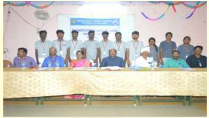
Glimpse of the event