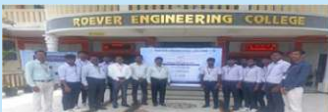
Glimpse of the event

The IEI Students' Chapter, Department of Mechanical Engineering organized a Workshop on "Surface Modeling in CATIA" on 19 August 2024.