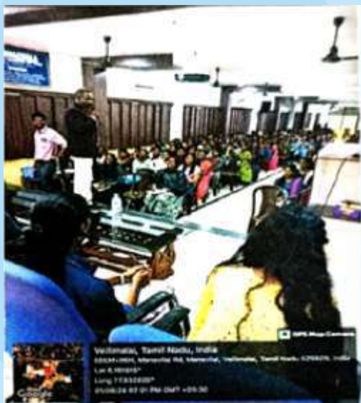
Glimpse of the event

The IEI Students' Chapter organized a Skill Development programme on 01 August 2024.