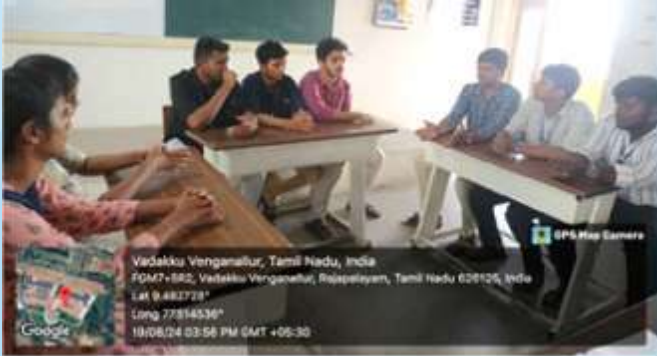
Participants of the event

The IEI Students' Chapter conducted Group Discussion on 19 August 2024 on the topics 'The Impact of Social Media on Youth', 'Pros and Cons of Online Learning', 'The Impact of Global Pandemics on Society', 'The Impact of Climate Change and What We Can Do to Combat It' and 'Is Technology Making Us More Isolated'.