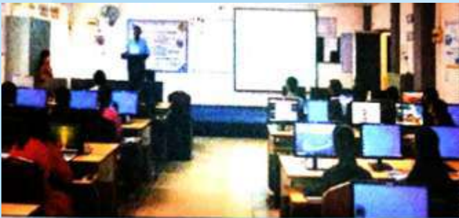
View of the speaker addressing the participants

The IEI Students' Chapter organized a two-day workshop on "Web Application Development Using Python (Django and Flask)" during 26 -27 July 2024.