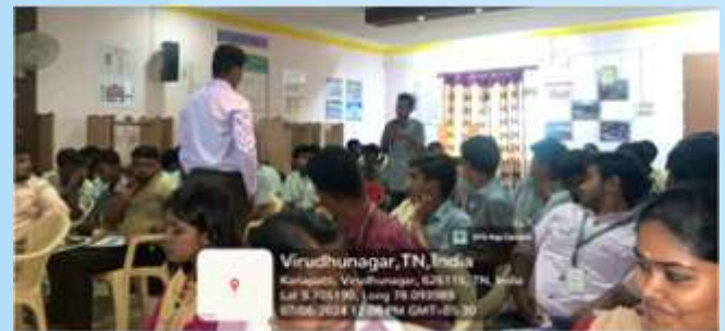
Speaker delivering lecture

The IEI Students' Chapter, Department of Mechanical Engineering organized a Seminar on "Overall Car Design And Development" on 08 July 2024.