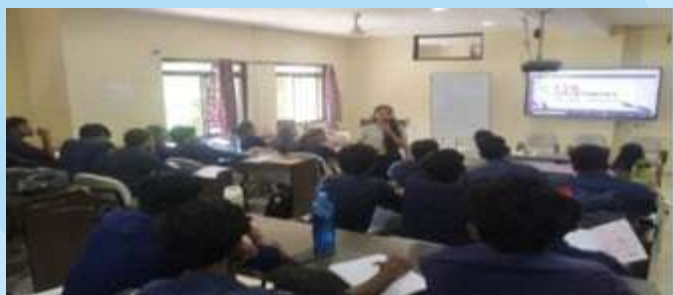
Glimpses of Lecture Delivered

They arranged a Site Visit on "Design of Reinforced Concrete Structure" on 20 July 2024.