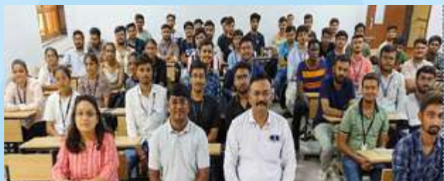
View of participants in Expert Talk

The IEI Students' Chapter, Department of Civil Engineering organized an expert talk on the topic "From Idea to Completion: A Step-By-Step Guide to Project Work" on 13 July 2024.