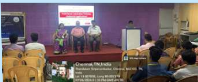
Glimpse of the event

The IEI Students' Chapter, Department of Mechanical Engineering had organized Initiation Day and Invited Talk on 'Multi-Facets Lubrication Tribology: Emphasizing Industrial Applications' on 26 July 2024 and a one day workshop on 'Composite Materials' on 17 August 2024.