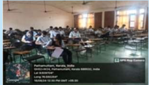
Glimpses of the events

The Students' Chapter, Department of Electrical and Electronics Engineering organized an Aptitude test based on software coding on 16 August 2024.