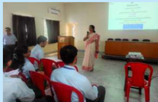
Speaker delivering lecture on the topic