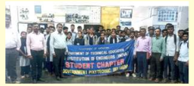
Participants during the Industrial Visit

The Student Chapter of IEI organized Academic Visit to ITI Belagavi to learn on "Robert Welding