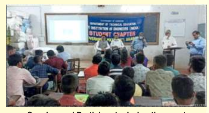
Speaker and Participants during the event

The Student Chapter also organized Campus Recruitment Drive on 15 June 2023; 19 June 2023 and 26 September 2023, 21 February 2024 and 13 March 2024.