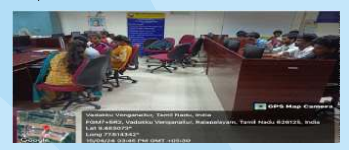
Glimpse of the event

The IEI Students' Chapter also organized a poster-making competition on the theme "The Future of Internet of Things (IoT) in Smart Cities" on 13 April 2024and an Aptitude test on 15 April 2024.