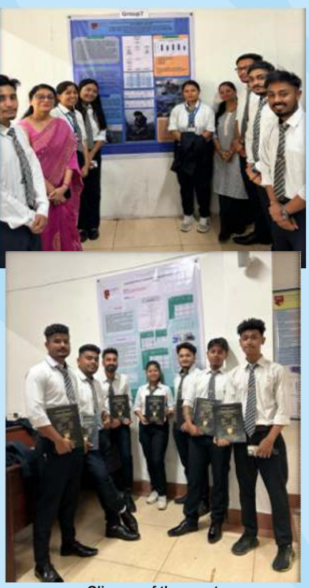
Glimpse of the event

The IEI Students' Chapter hosted a poster presentation competition on 17 May, 2024.