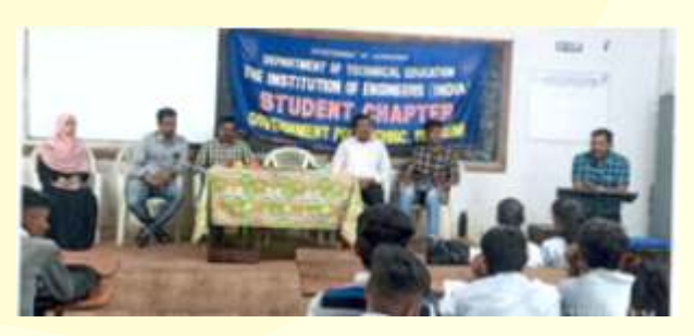
View of the dais during the event

programme on "DCET Toppers Felicitation" on 18 November 2023.