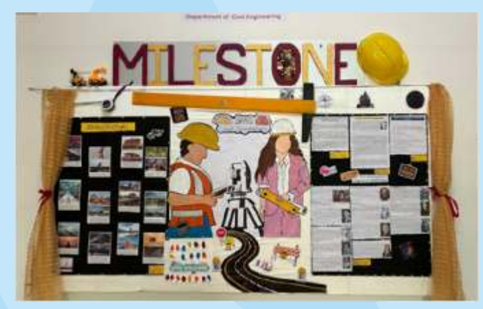
Launch of Magazine

The IEI Students' Chapter Department of Civil Engineering released a Wall Magazine on the theme "MILESTONE" on 08 May 2024.