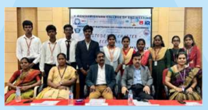
Inauguration of Student Chapter

The IEI Students Chapter of Electronics and Communication Engineering,-(ECE) Branch was inaugurated at K. Ramakrishnan College of Engineering, Trichy, Tamil Nadu, on 25 May 2024.