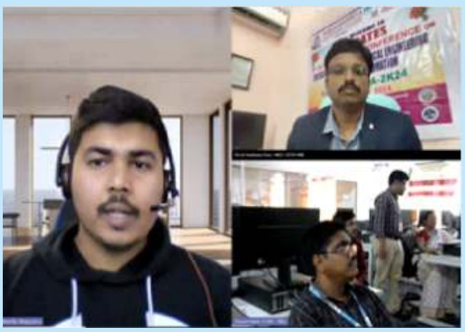
Screenshot of the conference

The IEI Students' Chapter also organized a One day Workshop on "Design Thinking and Innovation" on 19 June 2024.