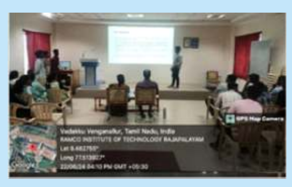
Student Participation in the Paper Presentation

The Students' Chapter also organized a Paper Presentation Event on 22 June 2024.