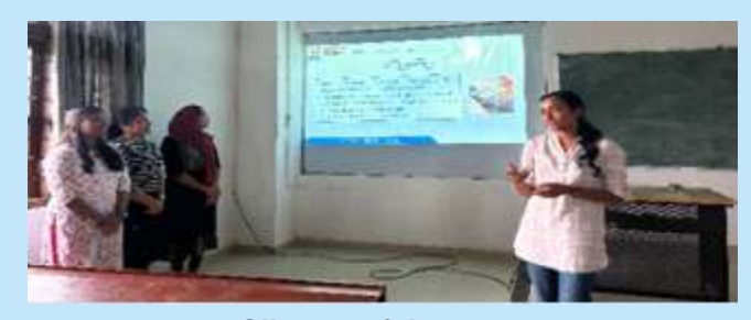
Glimpse of the event

A project presentation event was organized by the Students' Chapter of Department of Food Technology on the topic "Development of Fish Decaying Equipment for Medium-sized Fishes" and "Megeff: An Effervescent Ready to Mix Utilizing Nutmeg Pericarp-Formulation, Optimization and Analysis" on 07 May 2024.