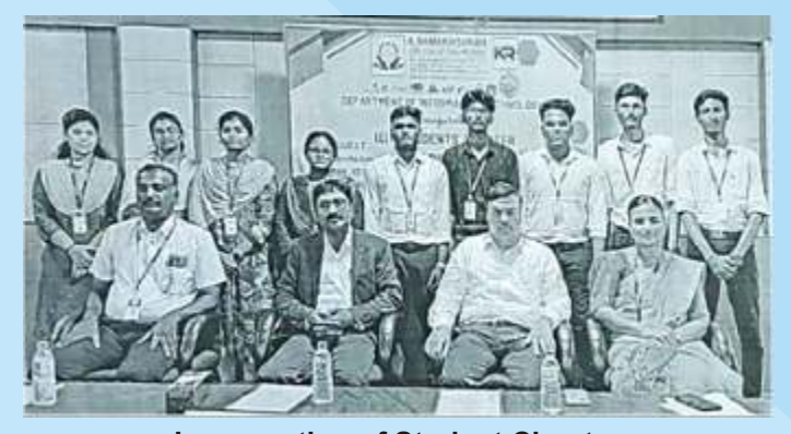
Inauguration of Student Chapter

The IEI Students Chapter of Department of Information Technology was inaugurated at K. Ramakrishnan College of Engineering, Trichy, Tamil Nadu, on 03 June 2024.