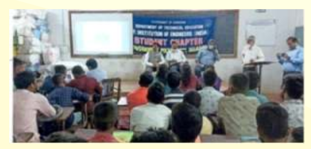
Glimpse of the event

The Student Chapter of IEI arranged Industrial Visit to KMF Milk Factory on 04 October 2023, to Belgaum Sugars Pvt. Ltd, Belgavi on 10 November 2023 and to Govt Tool Room and Training Centre on 30 January 2024.