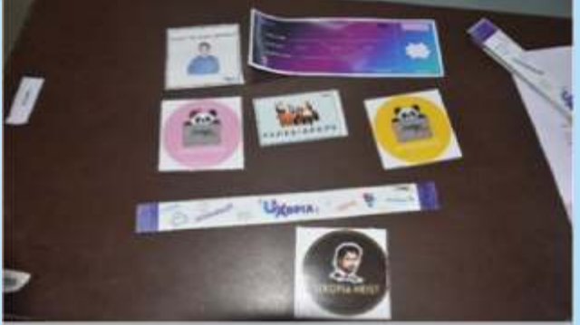
Glimpse of the event