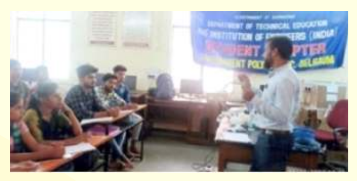
Trainer and the students during a Workshop

The Student Chapter organized a Technical Demonstration on "How to Use Fire Extinguisher" on 26 October 2023. They also