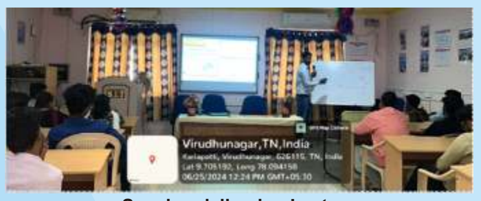
Speaker delivering Lecture

The IEI Student Chapter, Department of Mechanical Engineering organized a Seminar on "Geometric Dimensioning and Tolerancing" on 25 June 2024.