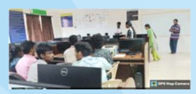
View of the Student Participation in Debate Contest

They organized the event "Grouped Debate" on 20 June 2024.