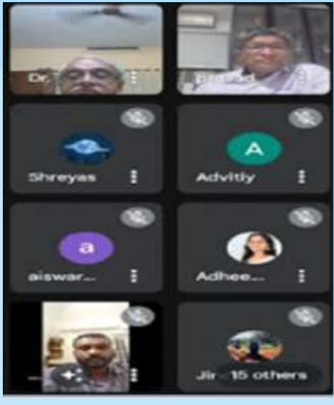
Screen-shot of the event

The IEI Student Chapter participated in Green Campus Campaign on 16 November 2023 and also organized a Cleaning drive as part of Green campus Initiative on 13 December 2023.