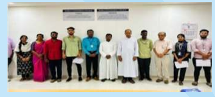
Flyer of the event

The IEI Student Chapter organized a Technical Workshop on "Towering Tension" and "BIM Master" program on 27 April 2023 and a lecture on "Technical Aptitude Test" on 05 May 2023.