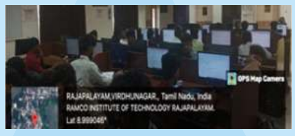
Glimpse of the event