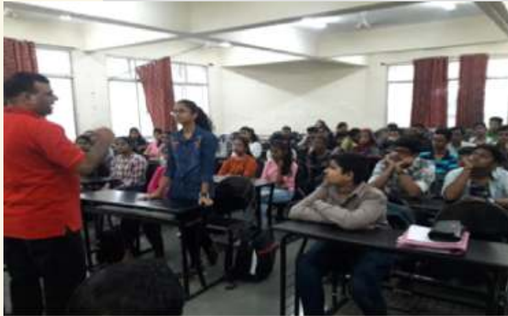
View of the speaker and the participants during the lecture

The IEI Student Chapter of AISSMS Polytechnic, Pune organized an Expert Lecture on "Importance and Benefits of IEI Students Chapter" during First Year Induction Program on 20 August 2019 and an Expert Lecture on "Role of Students Chapter in Engineering Education" on 21 August 2019.