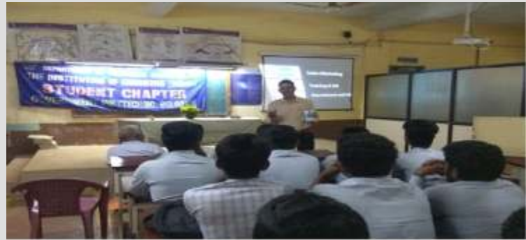
A view of the speaker and the audience of during the seminar on 22 August 2019

Industry Interaction" on 27 September 2019 and (x) "Best Practices of Total Quality Management" on 27 September 2019 were conducted. The Students' Chapter also organized a one day workshop on "Career Guidance" on 6 September 2019, a demonstration on "Robotics" on 21 September 2019, a video session on "Application of Heat Transfer Process" on 25 September 2019. An all India Eassy Writing event was also arranged on "All Love is Expansion, All Selfishness is Contraction – Swami Vivekananda" on 29 September 2019.