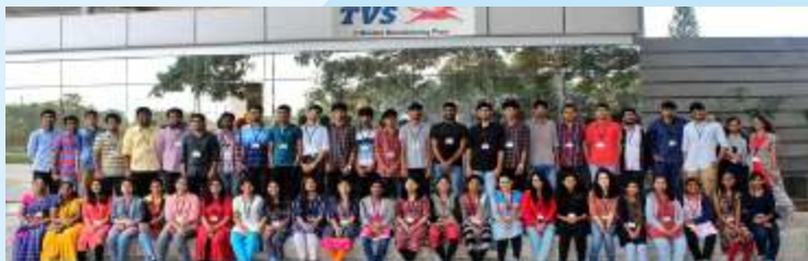
Get-together of the participants during the industrial visit

The IEI Students Chapter of Information Science & Engineering Department of BNM Institute of Technology organized an Industrial Visit to TVS Motor Co Ltd for the students to learn about the development techniques and automation process in an industry on 17 September 2019.