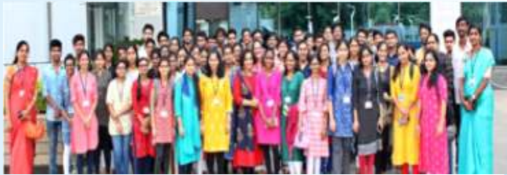
Get-together of the participants during the industrial visit

The Students' Chapter of Computer Science Engineering Department organized a one day industrial visit to IBM, Green Data Centre (GDC), Bangalore on 13 September 2019.