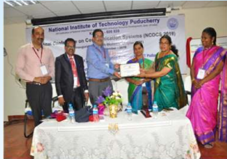
View of the dias during the inaugural function