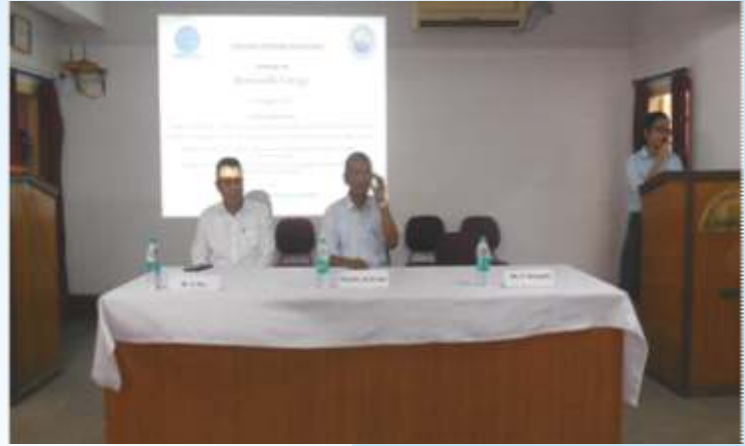
View of the dias and speaker during the seminar

The IEI Student Chapter of Department of Electrical Engineering St. Thomas' College of Engineering & Technology organized a seminar on "Renewable Energy".