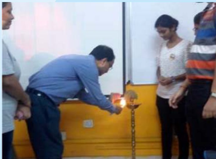
Lighting of the lamp during the inaugural ceremony of observation of International Day of Light

The IEI Student Chapter of RCC Institute of Information Technology, Electronics & Communication Engineering Department observed International Day of Light on 10 June 2019 and one technical seminar on "Internet of Things" on 29 August 2019 and a Technical Seminar on