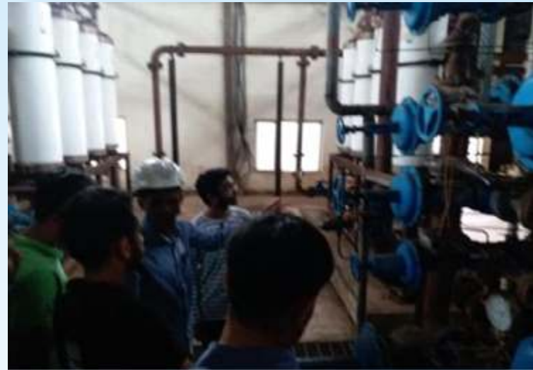
Participants during the Industrial Visit