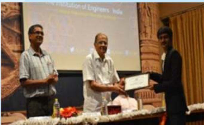
View of the dias and speaker during the inaugural session of the seminar