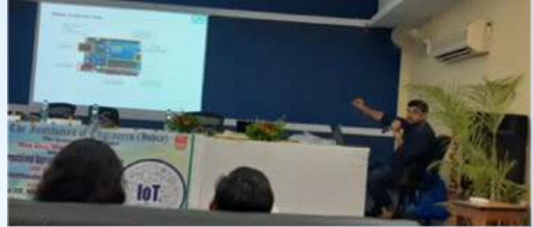
Speaker during the workshop

The IEI Students' Chapter of Electronics and Communication Engineering Department of NSHM Knowledge Campus organized a workshop on "Societal Computational approach with Internet of Things (IoT)" on 29 August 2019.