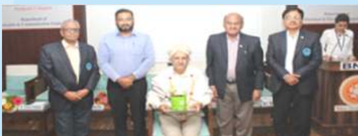
View of the dias during felicitation of Chairman, IEI, Karnataka State Centre