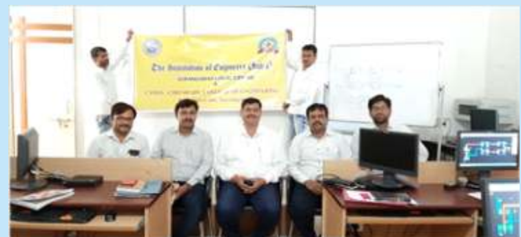
View of the participants during the workshop