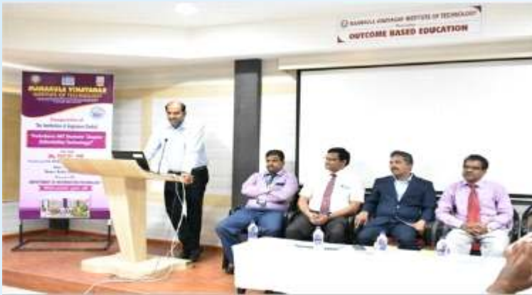
View of the dias during the inaugural ceremony

The IEI Students' Chapter of Information Technology Department of Manakula Vinayagar Institute of Technology, Puducherry was inaugurated on 7 September 2019.