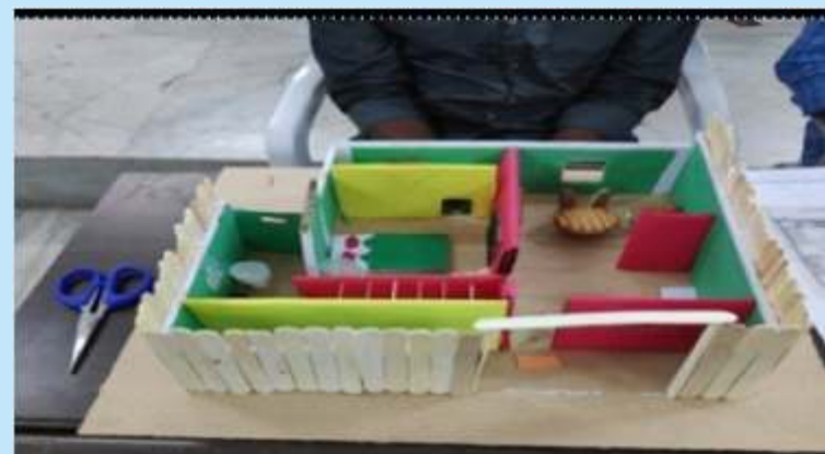
Prize received by the awardees during a competition in the event