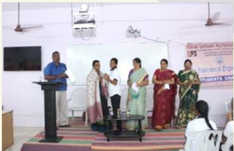
View of the dias during the Engineer's Day celebration