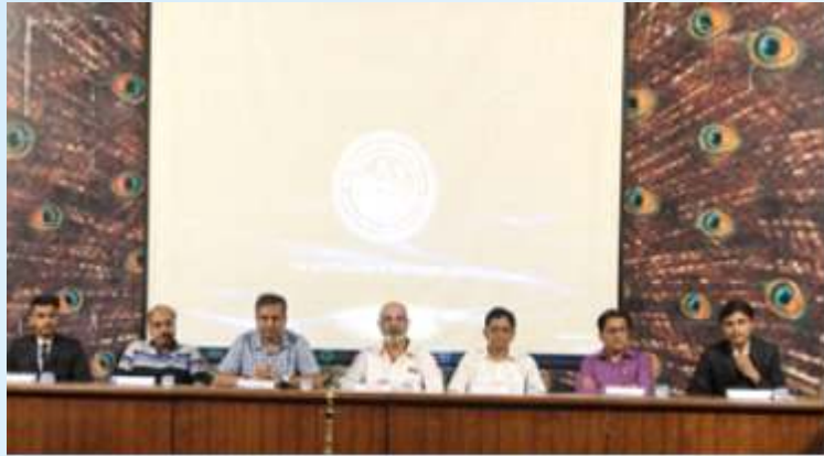
View of the dias during the orientation programme

A seminar was also organized by the Students' Chapter of Department of Civil Engineering of BVM Engineering College on 6 July 2019 to create awareness and preparation regarding GATE Examinations. They also organized an orientation program on 5 September 2019 and a seminar on Water on 7 September 2019.