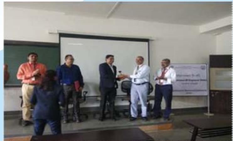
View of the dias during the guest lecture

The IEI Students' Chapter of Mechanical Engineering Department of Sandip Institute of Engineering & Management organized a guest lecture on "Goal Setting & Stress Management" on 25 September 2019 and a "Group Discussion" on 26 September 2019.