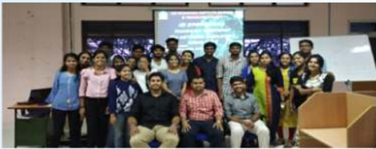
View of the participants during the workshop