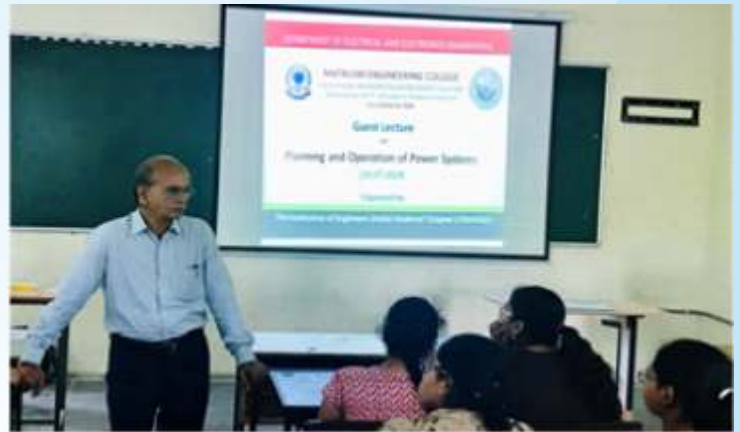
View of the lecturer

The IEI Student Chapter of Department of Electrical Engineering of Matrusri Engineering College organized a Guest Lecture on "Planning and Operation of Power Systems" on 26 July 2019 and a three-day workshop on "Power Electronics Applications in Renewable Energy by using MATLAB and IOT" from 7-9 August 2019 in association with Pantech ProEd Pvt Ltd, Hyderabad.