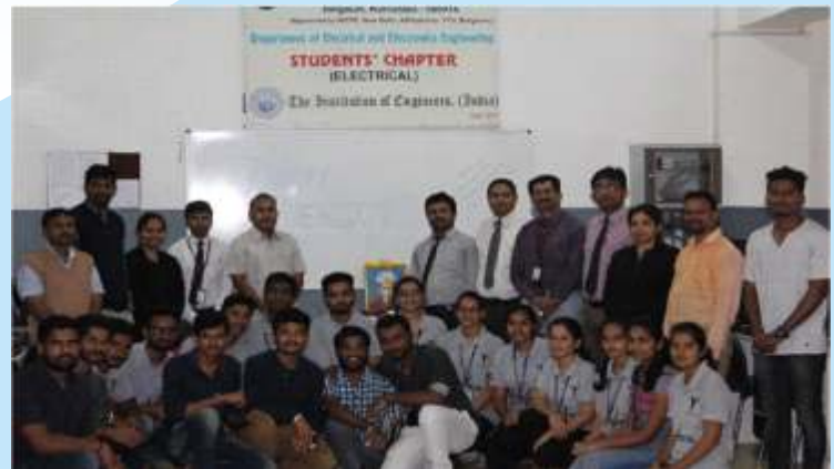
Gathering of participants during the Engineers Day celebration

The IEI Students' Chapter of Electrical & Electronics Engineering Department of Jain College of Engineering, celebrated "Engineers Day".