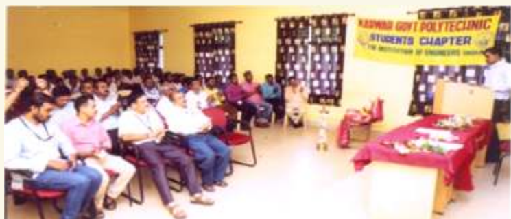
Participants during the Engineers Day celebration