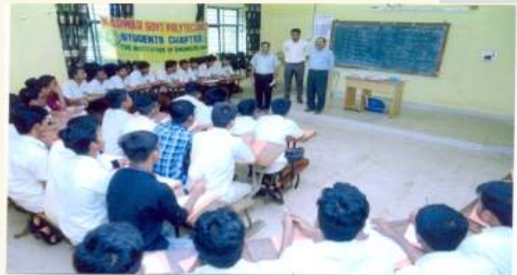
Participants during the Orientation Programme

The IEI Student Chapter of Govt. Polytechnic, Karwar conducted a two days Orientation Programme during 23- 24 July 2019 and a lecture on "Engineering for Change" on 16 September 2019.