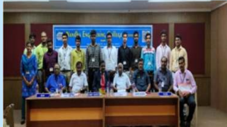
View of the dias during the inaugural function

The Inaugural Function of IEI Student Chapter of Mechanical Engineering Department of Nandha Engineering College Chapter was held on 22 August 2019 and an Industrial seminar on "KICK START YOUR CAREER" jointly with Society of Mechanical Engineers (SOME) on 29 August 2019.