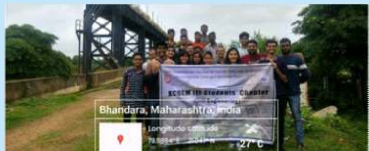
Participants during the industrial visit

The IEI Students' Chapter of Civil Engineering Department of Shri Ramdeobaba College of Engineering & Management organized an Industrial Visit to Lower Chulbund Lift Irrigation Project, Sakoli on 27 July 2019.