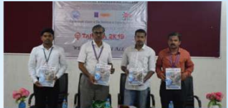
The view of the participants and dias during the technical symposium