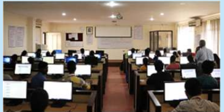
View of the participants of the workshop