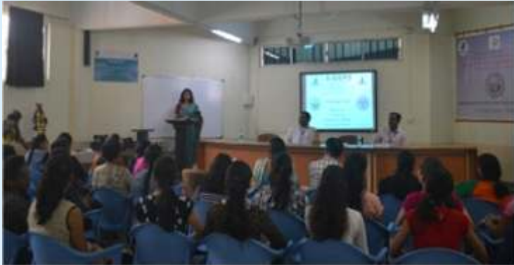
View of the audience during the workshop

The IEI Student Chapter of Department of Electronics and Telecommunication of AISSMS College of Engineering organized a one day workshop on "Leadership Development in Women Professional Entrants" on 12 July 2019. They also organized a Technical Symposium on "14th AISSMS Engineering Today 2019" during 18- 20 September 2019.