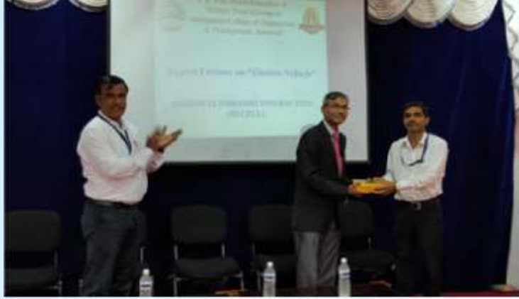
View of the dias during the inaugural session

The IEI Student Chapter of Mechanical Engineering Department of P R Pote Patil College of Engineering & Management organized Expert Lecture on "Electric Vehicle".