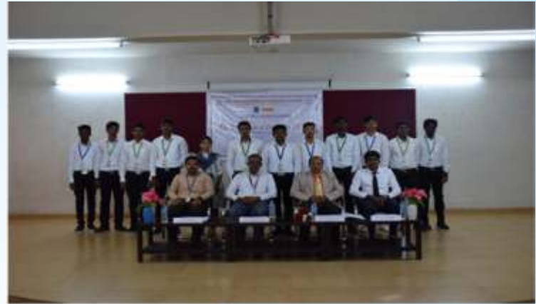
View of the dias during the inaugural ceremony

The IEI Student Chapter of Mechanical Engineering Department of Sri Ramakrishna Engineering College was inaugurated on 16 August 2019.