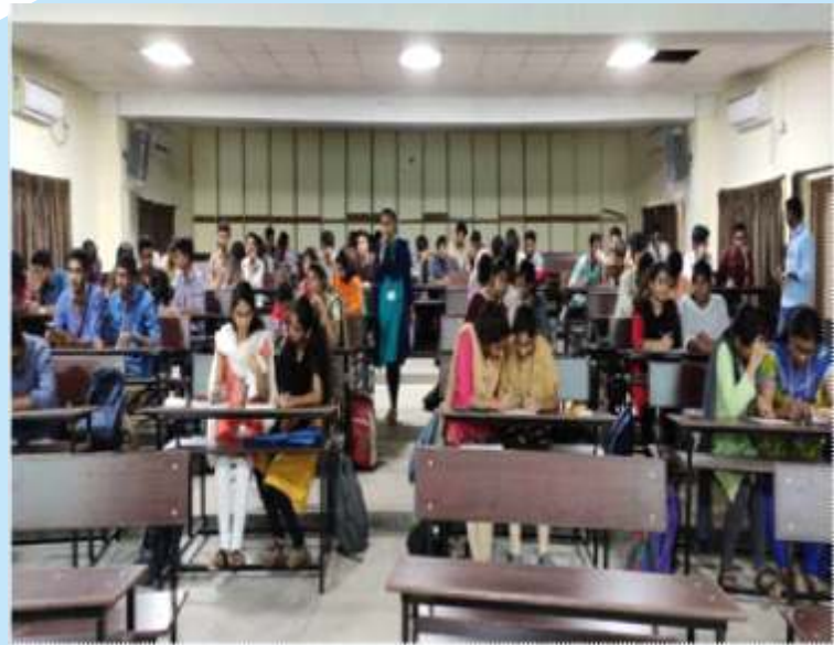
Participants during the quiz competition

The IEI Students' Chapter of Civil Engineering Department of Gayatri Vidya Parishad College of Engineering organized a Technical Quiz for the students on 17 July 2019.