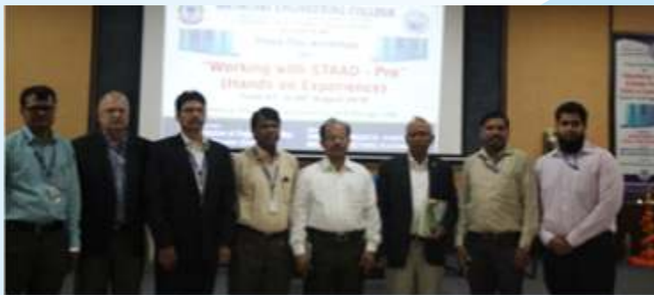
View of the dias and speaker during the workshop

The IEI Student Chapter of Civil Engineering Department of Gokaraju Rangaraju College of Engineering and Technology, has conducted a technical fest named 'ADVAITHA' on 17 August 2019.