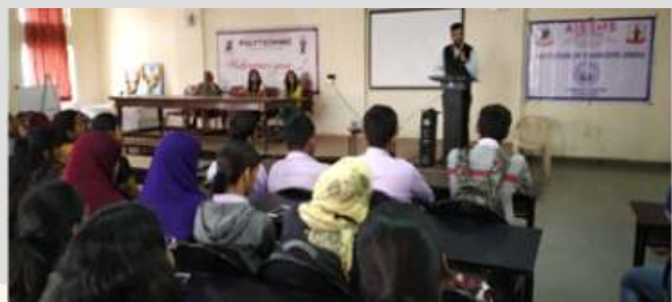
View of the audience during the workshop