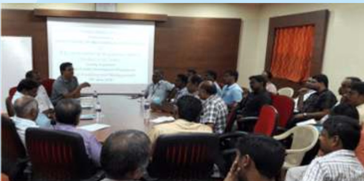
Participants in the faculty development programme

The IEI Student Chapter of Mechanical Engineering Department of Nandha Engineering College organized a Faculty Development Programme on "Energy Auditing and Management" on 19 June 2019.