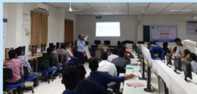
Participants during the workshop

The IEI Students' Chapter of Civil Engineering Department of LBR College of Engineering, organized a two two-day workshops on "Sketch Up Pro Software" during 30 – 31 August 2019 and on "GIS Professional Training" during 6 – 7 September 2019.